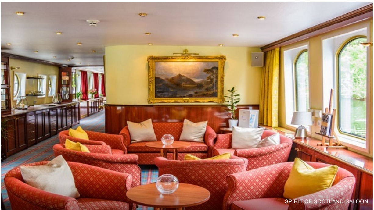
SPIRIT OF SCOTLAND SALOON