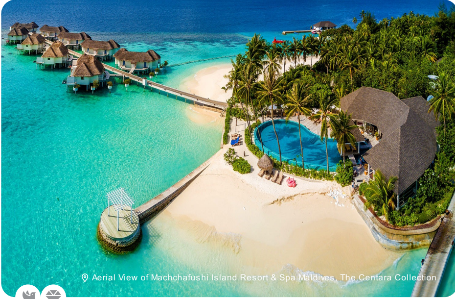
Aerial View of Machchafushi Island Resort & Spa Maldives, The Centara Collection