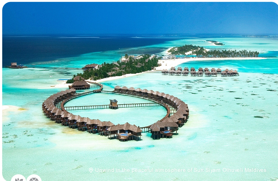
Unwind in the peaceful atmosphere of Sun Siyam Olhuvelli Maldives