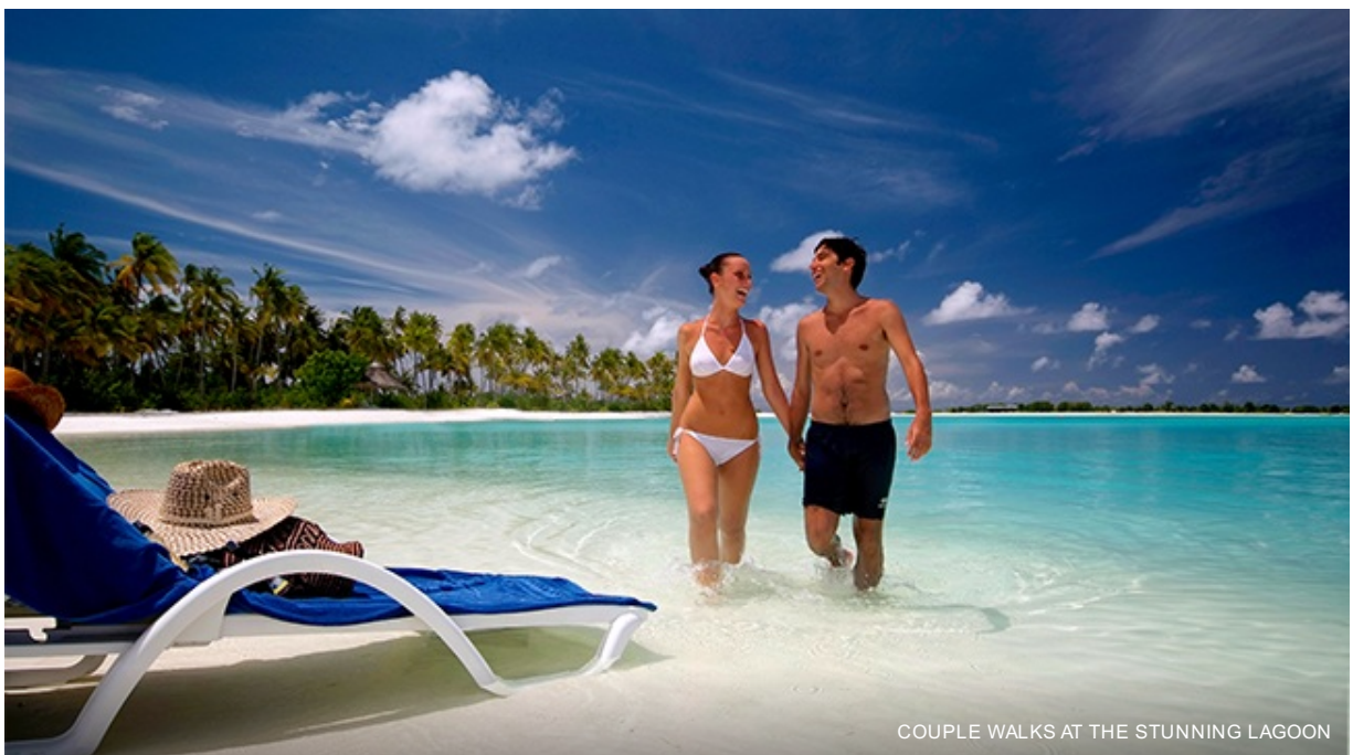
COUPLE WALKS AT THE STUNNING LAGOON