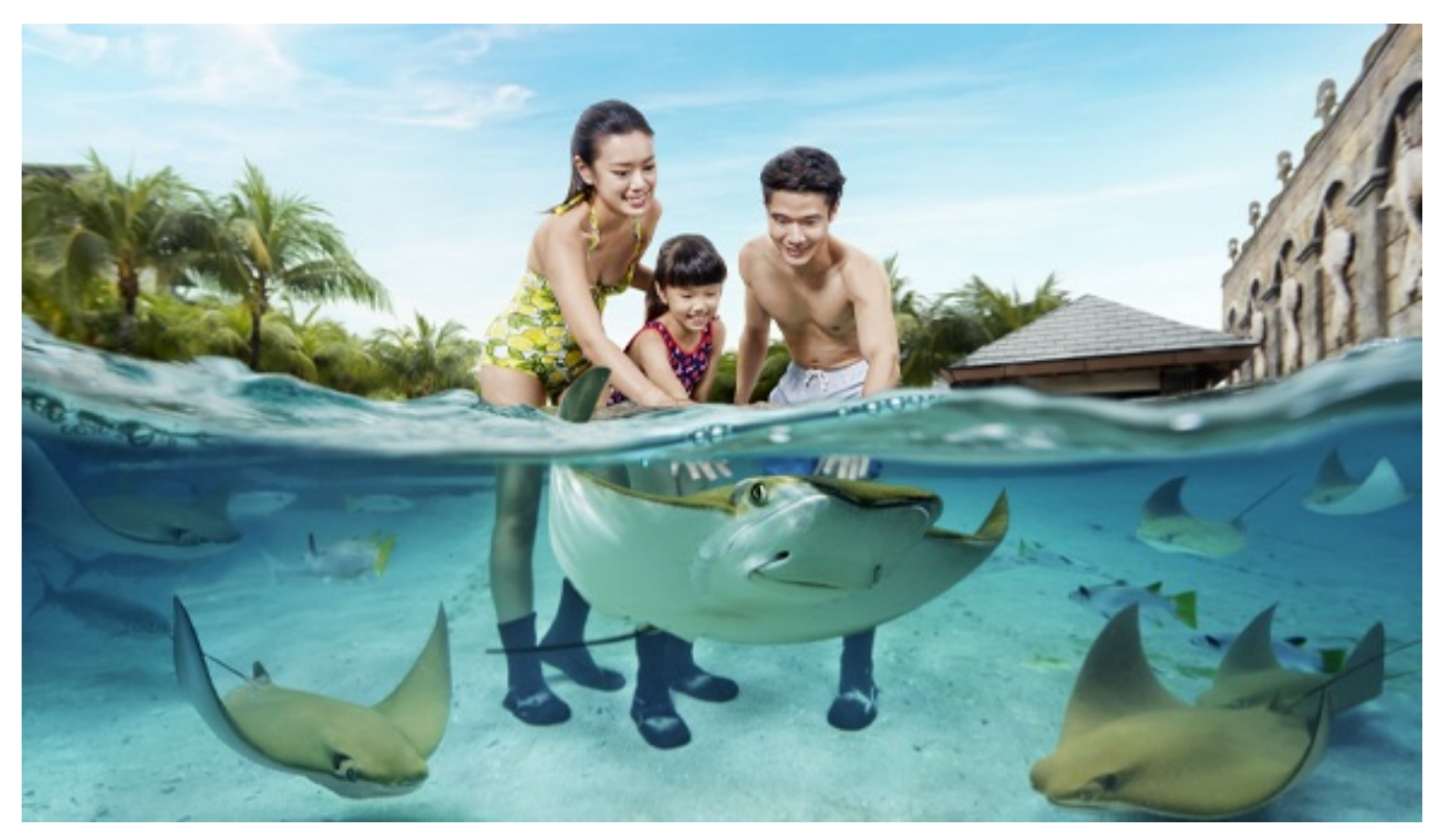
Prices are dynamic based on travel dates. Please proceed to Book Now or Contact Us for details.

With Adventure Cove Waterpark day pass, you can enjoy all the endless splashes of rip-roaring fun at asia's most amazing waterpark every day.