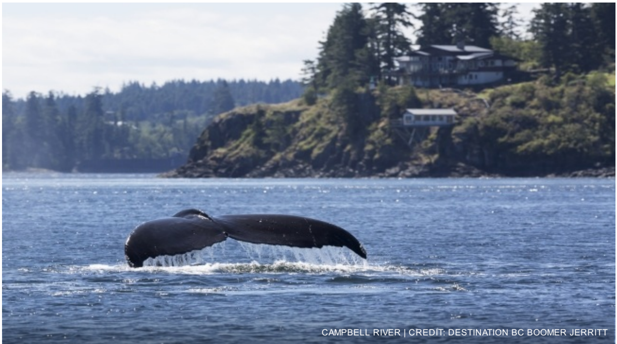
CAMPBELL RIVER

Overnight in Campbell River at the Comfort Inn & Suites