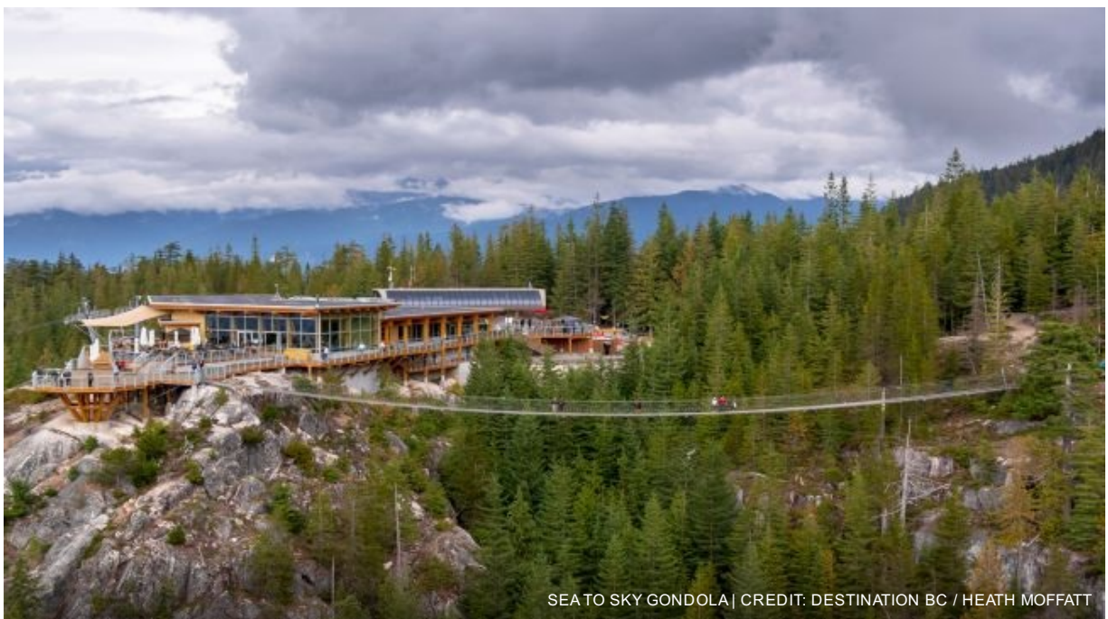
SEA TO SKY GONDOLA

Overnight at the Delta Whistler Village Suites