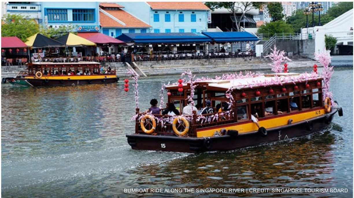
BUMBOAT RIDE ALONG THE SINGAPORE RIVER