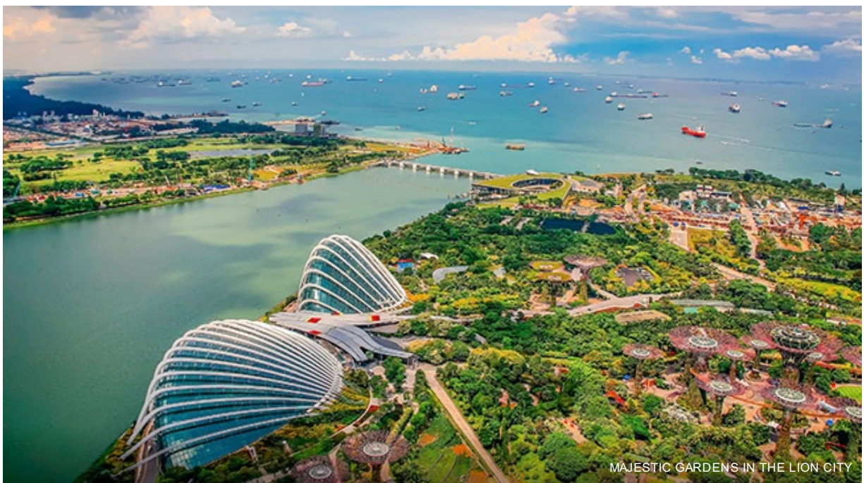
MAJESTIC GARDENS IN THE LION CITY