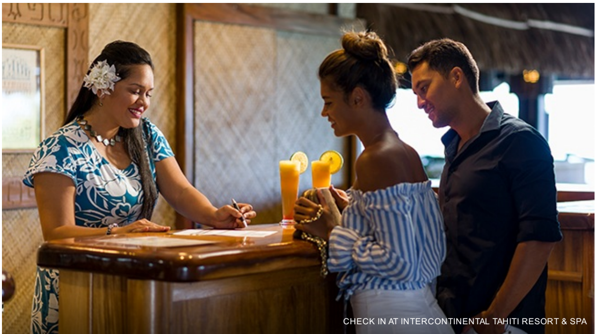
CHECK IN AT INTERCONTINENTAL TAHITI RESORT & SPA

Overnight stay in Tahiti at InterContinental Tahiti Resort & Spa in a Classic Garden View Room.