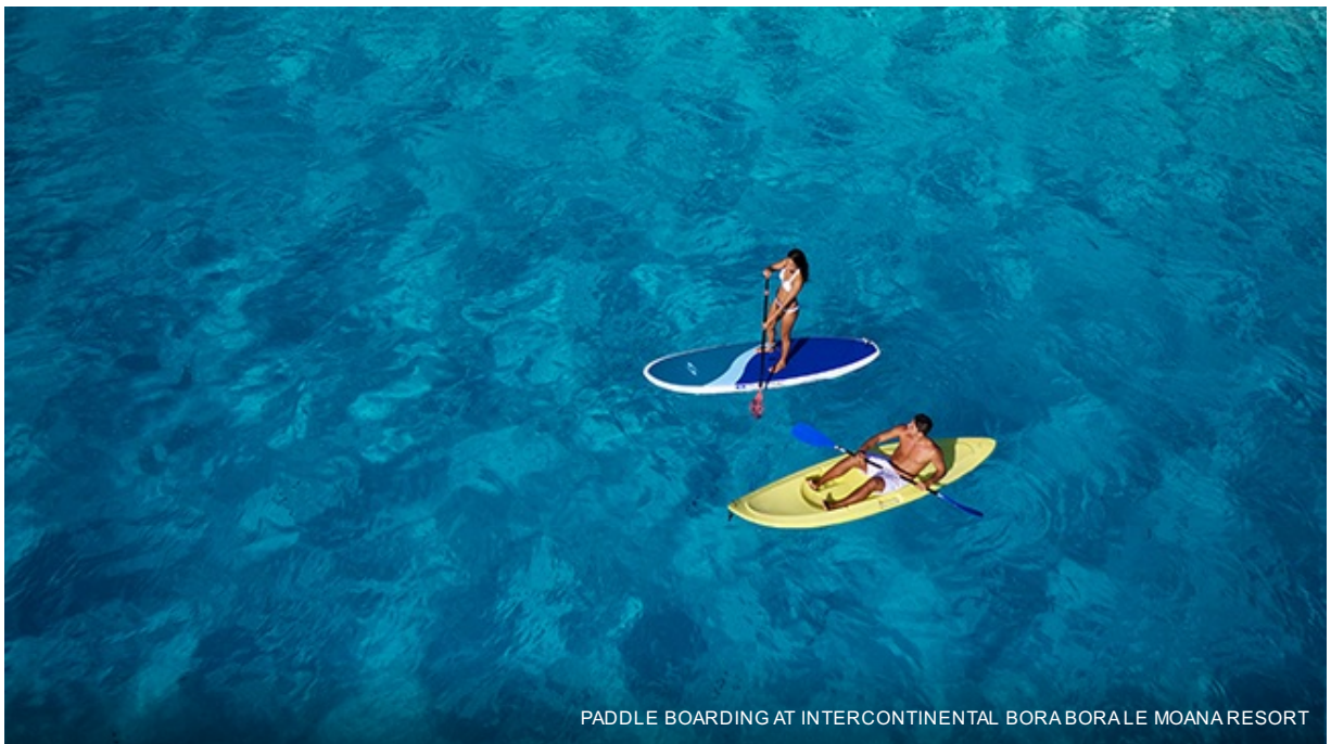
PADDLE BOARDING AT INTERCONTINENTAL BORA BORALE MOANA RESORT