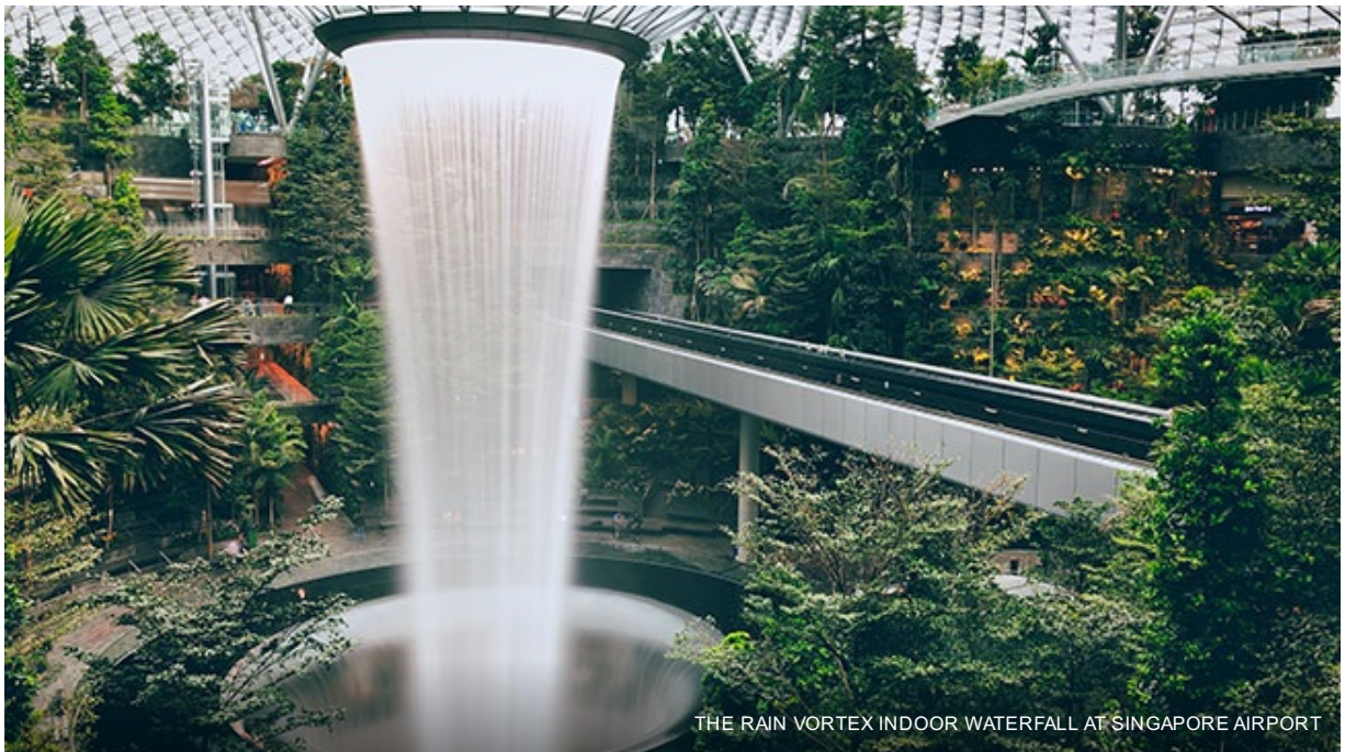
THE RAIN VORTEX INDOOR WATERFALL AT SINGAPORE AIRPORT