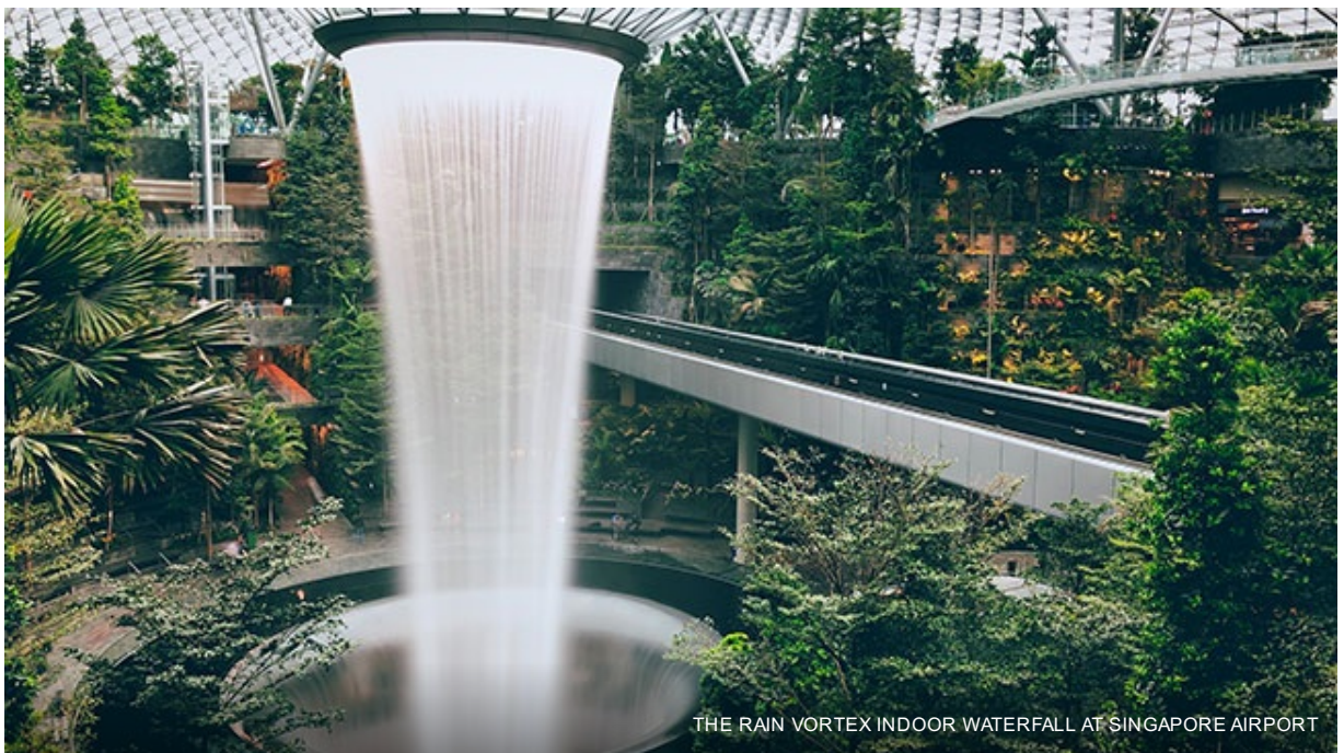
THE RAIN VORTEX INDOOR WATERFALL AT SINGAPORE AIRPORT