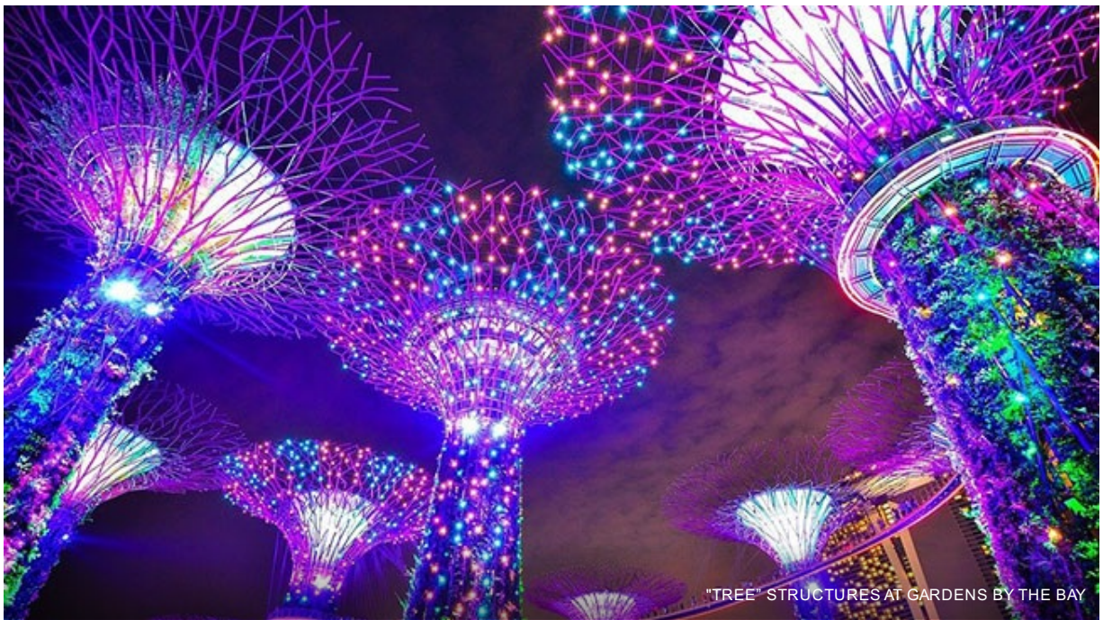
"TREE" STRUCTURES AT GARDENS BY THE BAY