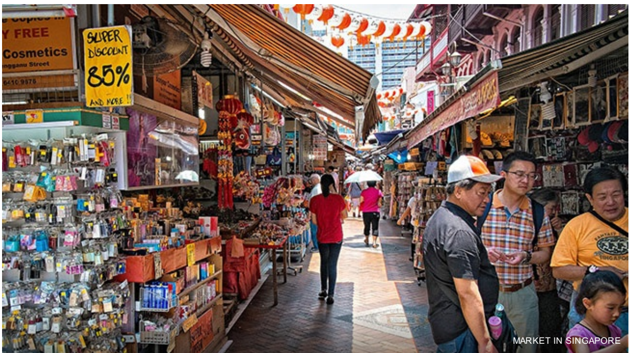
MARKET IN SINGAPORE