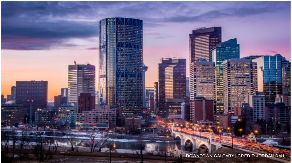
DOWNTOWN CALGARY