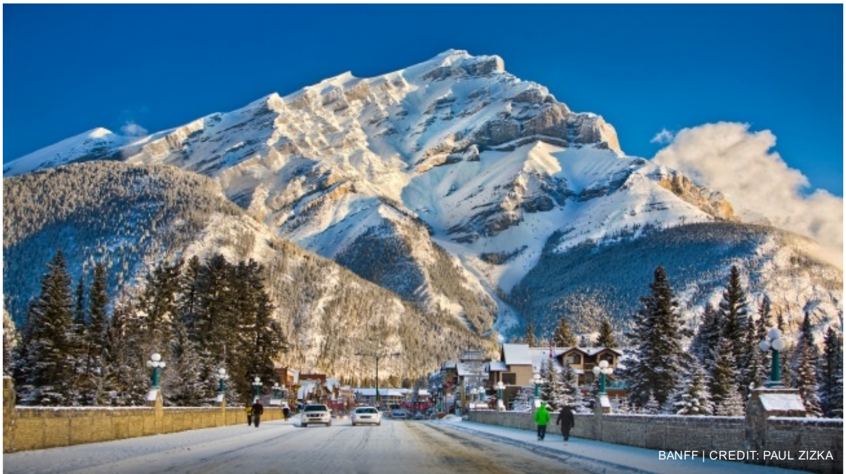
BANFF

Overnight stay in Banff at Banff Caribou Lodge (or similar)