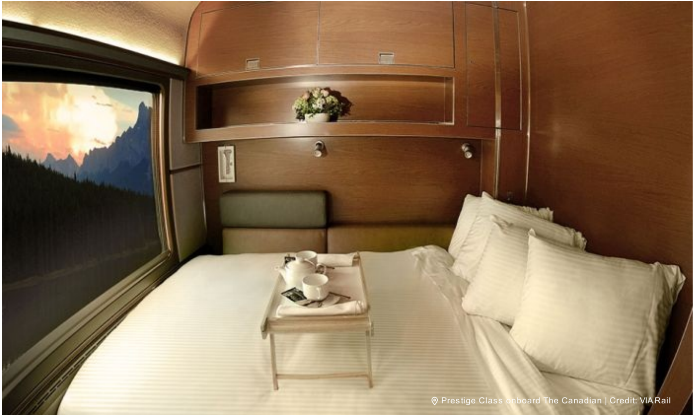
📍 Prestige Class onboard The Canadian

This is the most luxurious class on The Canadian train. These sleeper cabins are equipped with a double bed, a power outlet, a television, and a private bathroom with a toilet, a shower and a wash basin. Spacious cabin, which is 50% larger than the cabin for two in Sleeper Plus class, with a wide viewing window that is 60% larger. Modular L-shaped leather couch by day and a Murphy bed for two by night. The Prestige cabin also includes a mini-fridge stocked with a selection of beverages.