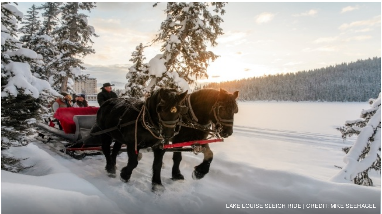
LAKE LOUISE SLEIGH RIDE