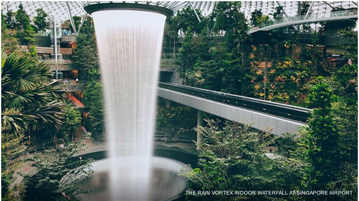
THE RAIN VORTEX INDOOR WATERFALL AT SINGAPORE AIRPORT