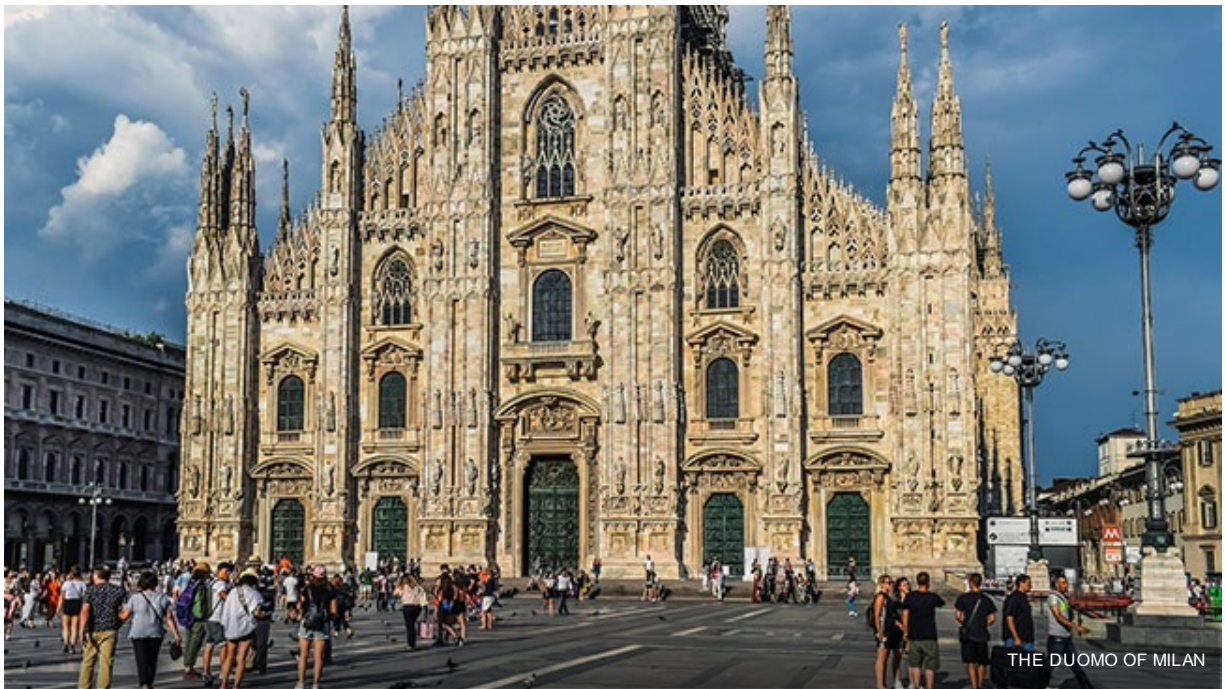
THE DUOMO OF MILAN