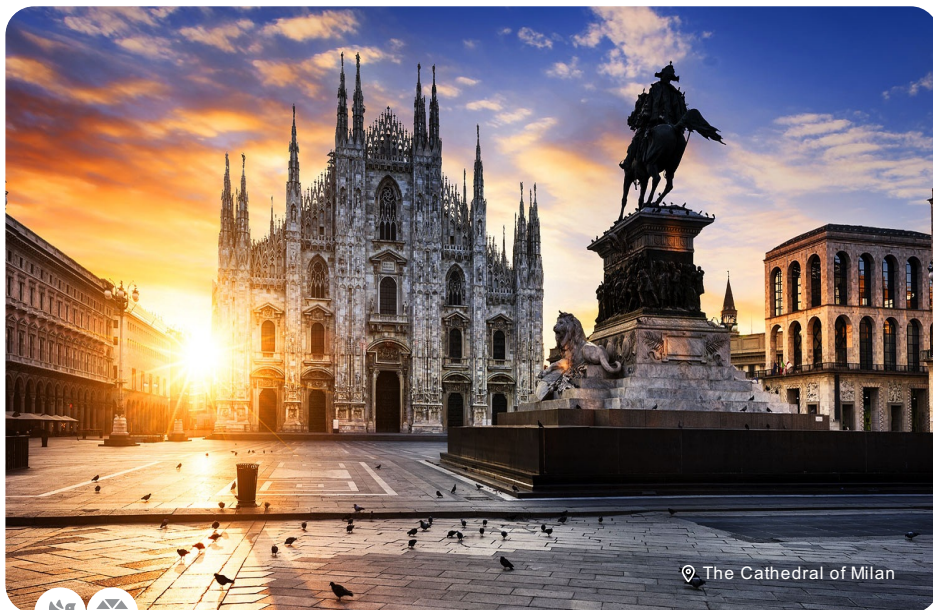
The Cathedral of Milan