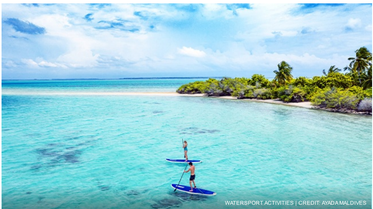
WATERSPORT ACTIVITIES