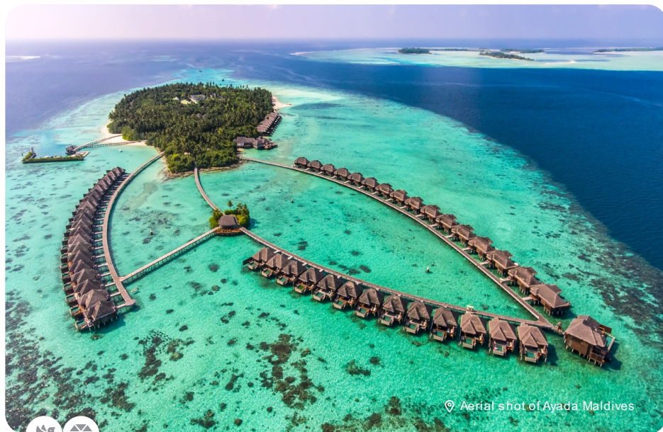
📍 Aerial shot of Ayada Maldives