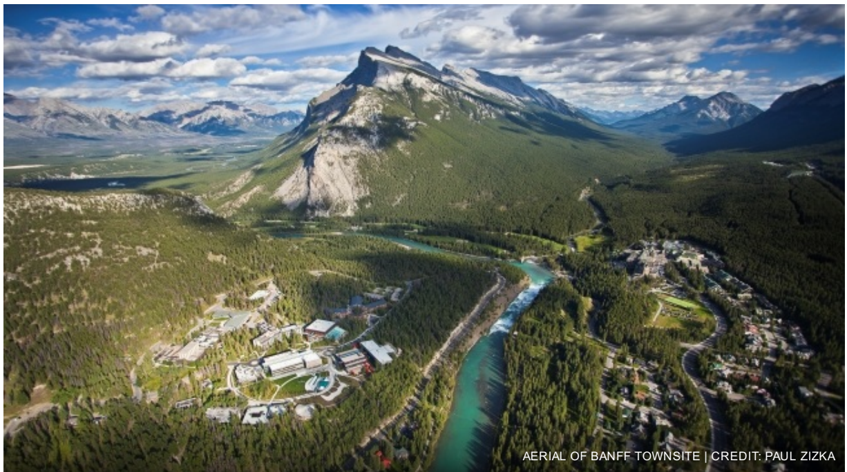
AERIAL OF BANFF TOWNSITE

Experience the best of Rocky Mountain National Parks' backcountry with our curated hiking tours. Revel in spring's wildflowers, summer's clear glacier views, and the golden hues of fall's larch trees. Our passionate local guides will lead you on classic hikes in the Banff and Lake Louise area, including Stanley Glacier, Larch Valley, Kootenay National Park Trails, and Plain of 6 Glaciers. Immerse yourself in nature's beauty across seasons in the Rockies.