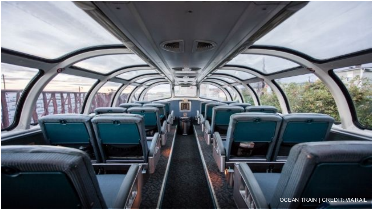
OCEAN TRAIN