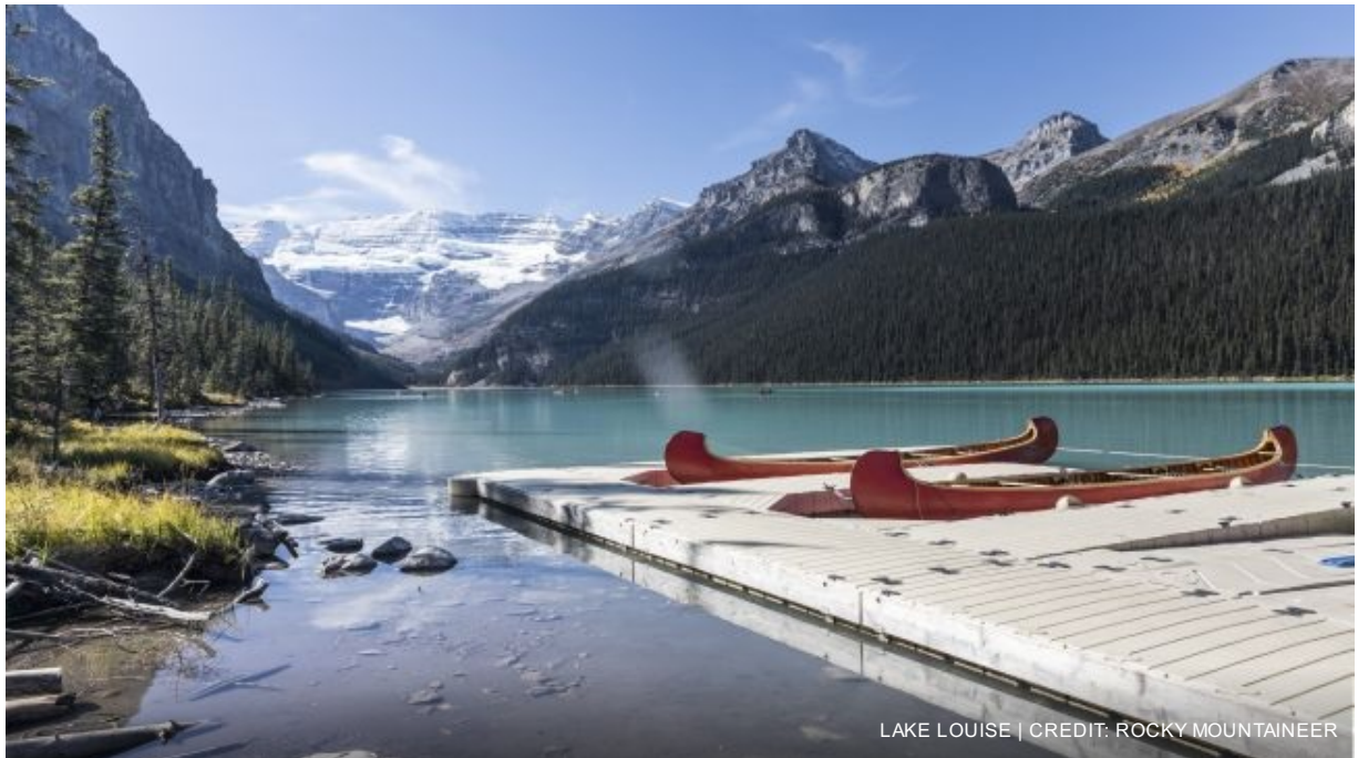
LAKE LOUISE

Overnight in Lake Louise at the Fairmont Chateau Lake Louise