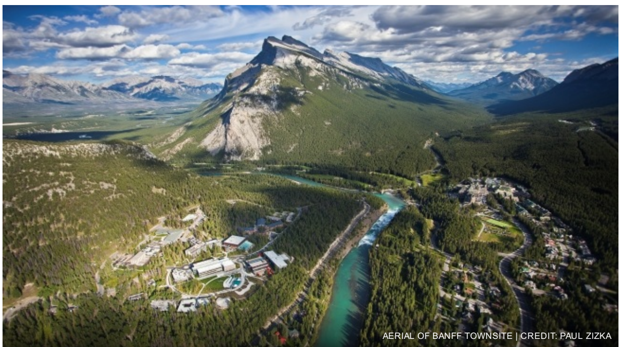
AERIAL OF BANFF TOWNSITE

Experience the best of Rocky Mountain National Parks' backcountry with our curated hiking tours. Revel in spring's wildflowers, summer's clear glacier views, and the golden hues of fall's larch trees. Our passionate local guides will lead you on classic hikes in the Banff and Lake Louise area, including Stanley Glacier, Larch Valley, Kootenay National Park Trails, and Plain of 6 Glaciers. Immerse yourself in nature's beauty across seasons in the Rockies.