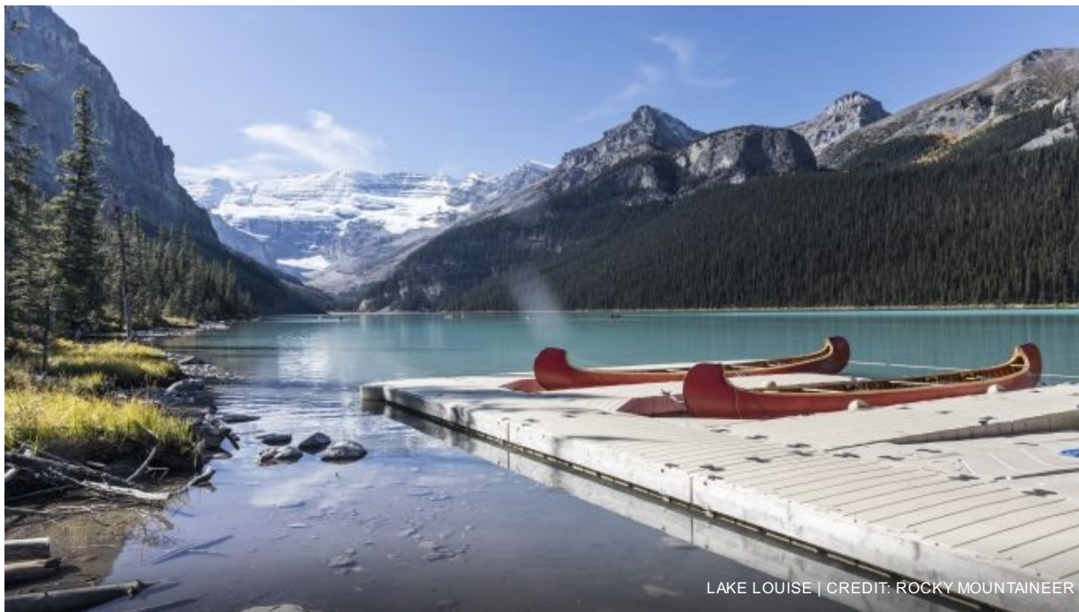
LAKE LOUISE

Overnight in Lake Louise at the Fairmont Chateau Lake Louise .