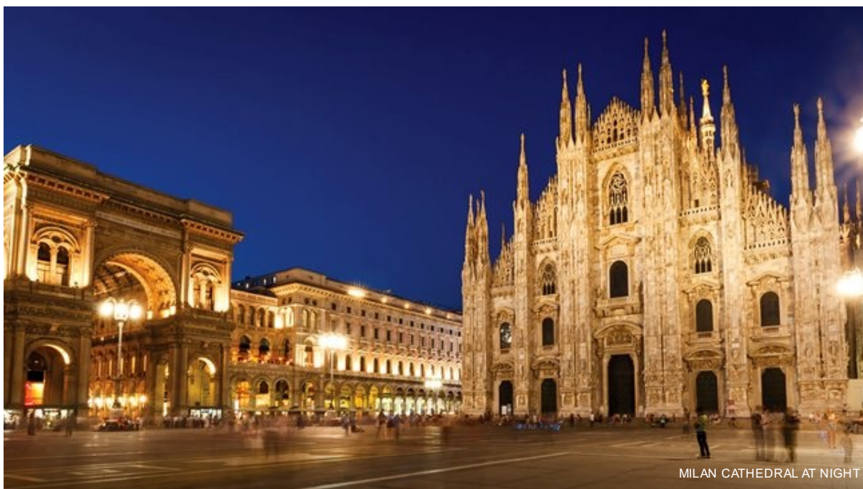
MILAN CATHEDRAL AT NIGHT

Overnight stay in Milan at Starhotels Ritz or Similar.