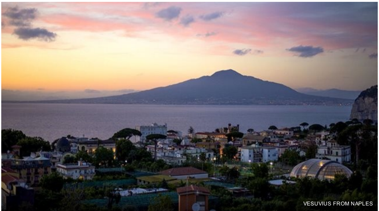
VESUVIUS FROM NAPLES