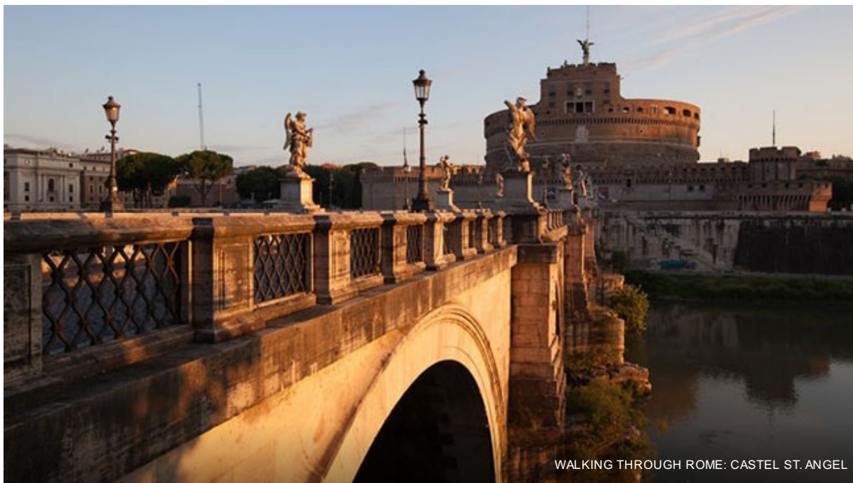
WALKING THROUGH ROME: CASTEL ST. ANGEL