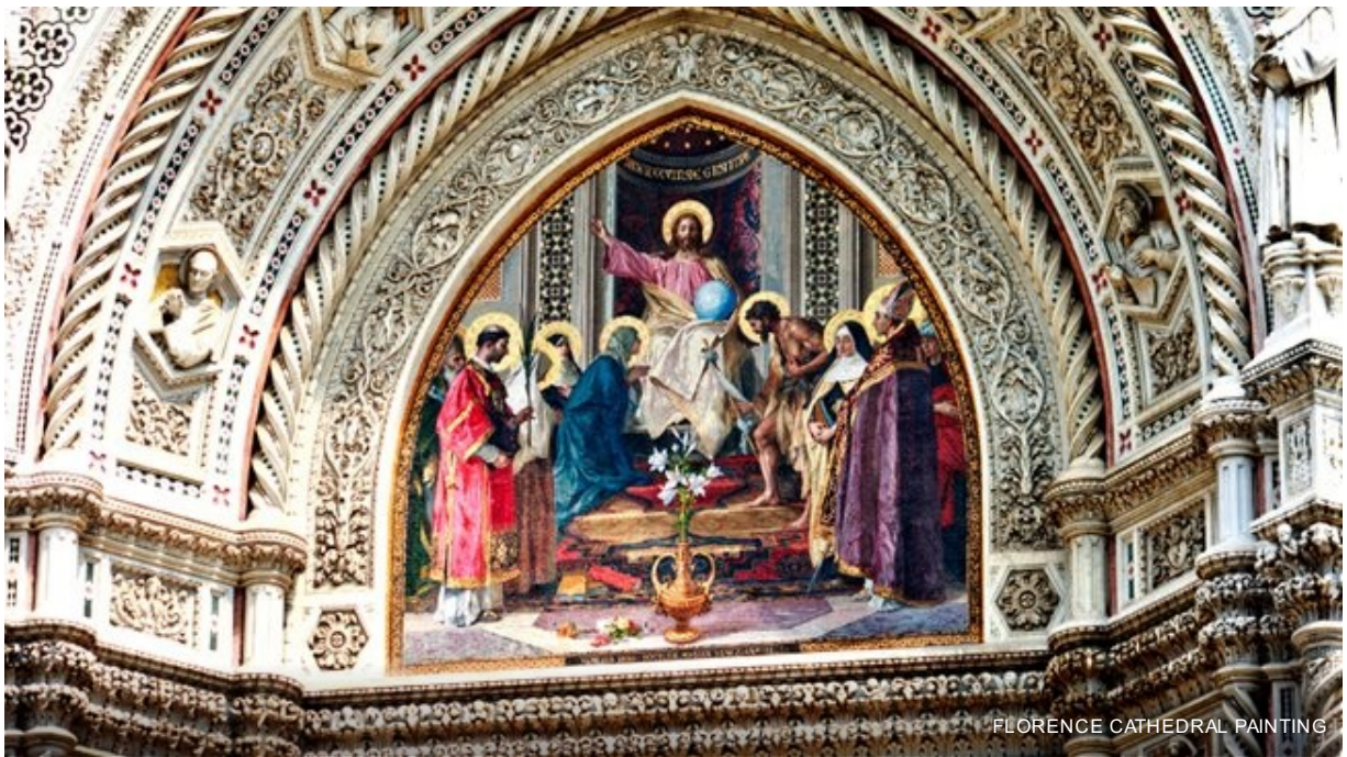
FLORENCE CATHEDRAL PAINTING