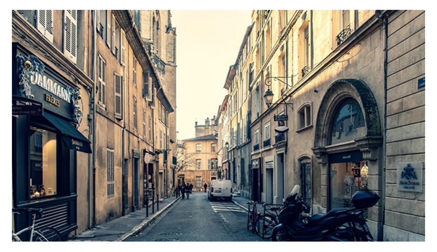
Prices are dynamic based on travel dates. Please proceed to Book Now or Contact Us for details.