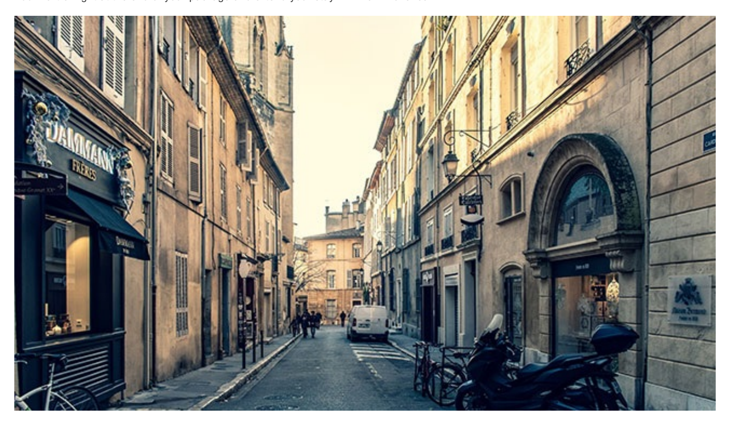
\hbox{Prices are dynamic based on travel dates. Please proceed to } \hbox{Book Now or Contact Us for details.} \\

Add 1 extra night at the end of your package and extend your stay in Aix-en-Provence!