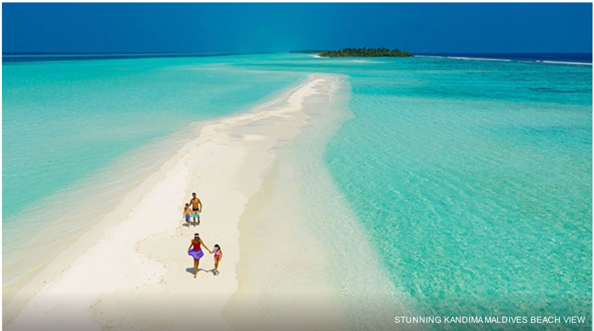
STUNNING KANDIMA MALDIVES BEACH VIEW