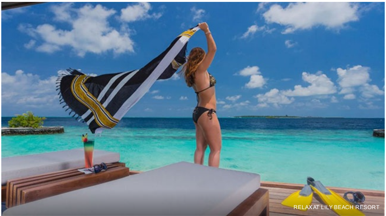
RELAX AT LILY BEACH RESORT

Jumpstart your stay for the next 6 days unwinding by the beach or engaging in the variety of activities Lily Beach Resort has to offer. Enjoy the three excursions that come with your All Inclusive plan. Dive into the sea and discover unique colonies of coral polyps with Coral Garden Snorkelling , one with the locals, traverse through the island and enjoy the sea with Sunset Cruise or be at ease while enjoying the view with Sunset Fishing Trip . Complimentary use of snorkelling equipment and non-motorised watersports are also included.