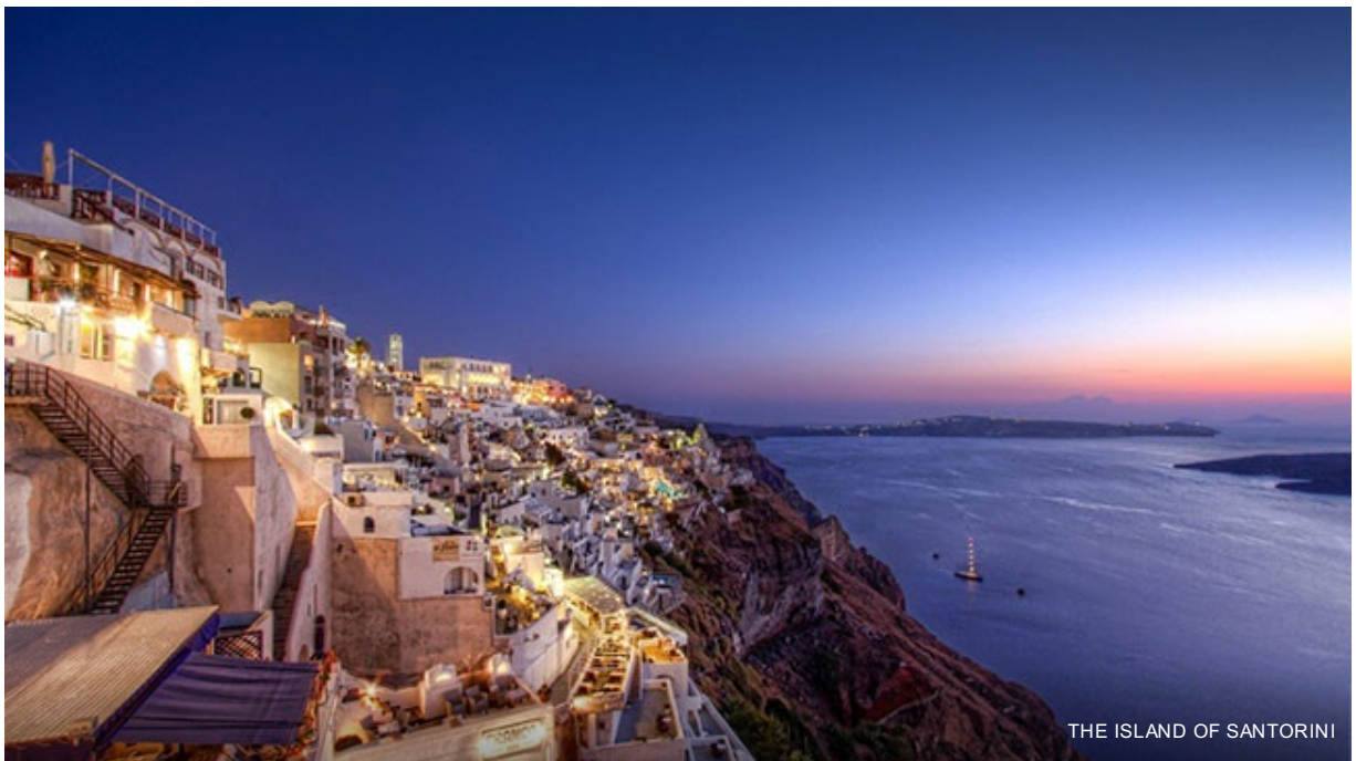
THE ISLAND OF SANTORINI