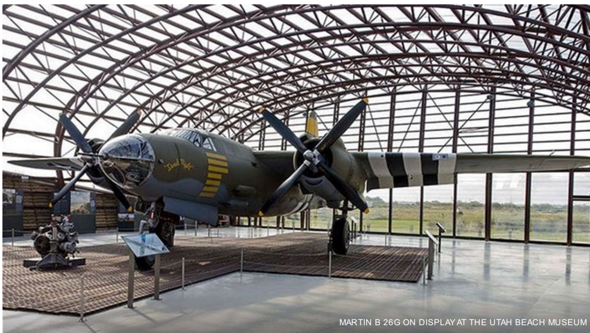
MARTIN B 26G ON DISPLAY AT THE UTAH BEACH MUSEUM