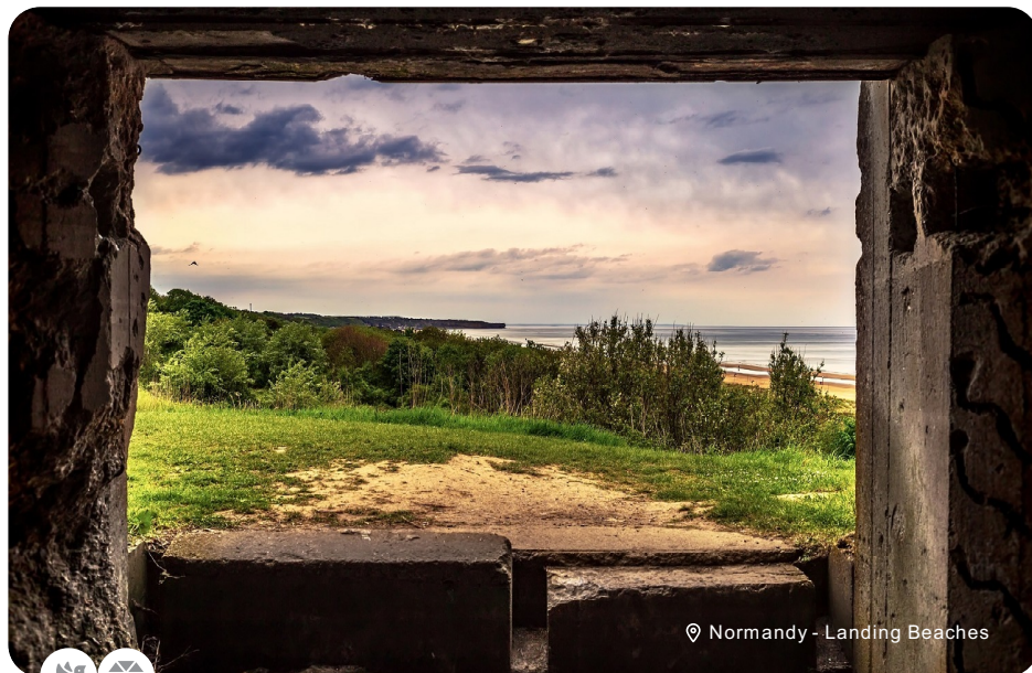
Normandy - Landing Beaches