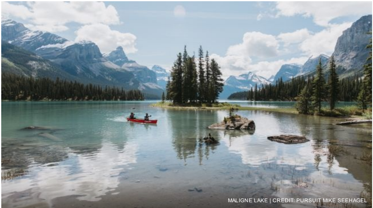
MALIGNE LAKE

Experience Jasper National Park's natural beauty with a small group float trip on the Athabasca River. Cover several miles on Class II rapids, offering mild excitement with a few splashes. Enjoy your guide's engaging storytelling about local history and wildlife throughout this gentle adventure.