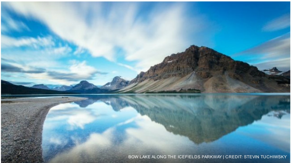
BOW LAKE ALONG THE ICEFIELDS PARKWAY