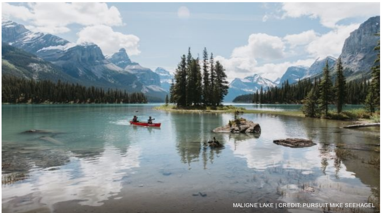
MALIGNE LAKE

Experience Jasper National Park's natural beauty with a small group float trip on the Athabasca River. Cover several miles on Class II rapids, offering mild excitement with a few splashes. Enjoy your guide's engaging storytelling about local history and wildlife throughout this gentle adventure.