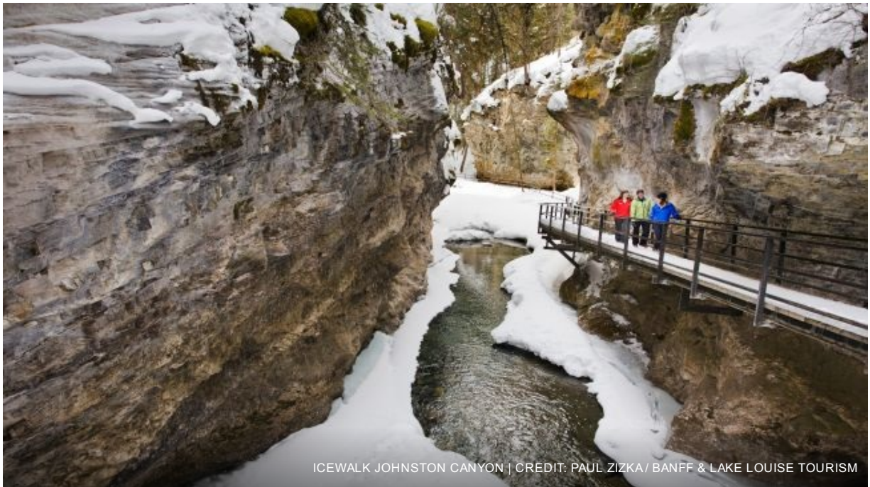
ICEWALK JOHNSTON CANYON

Overnight in Banff at The Mount Royal Hotel