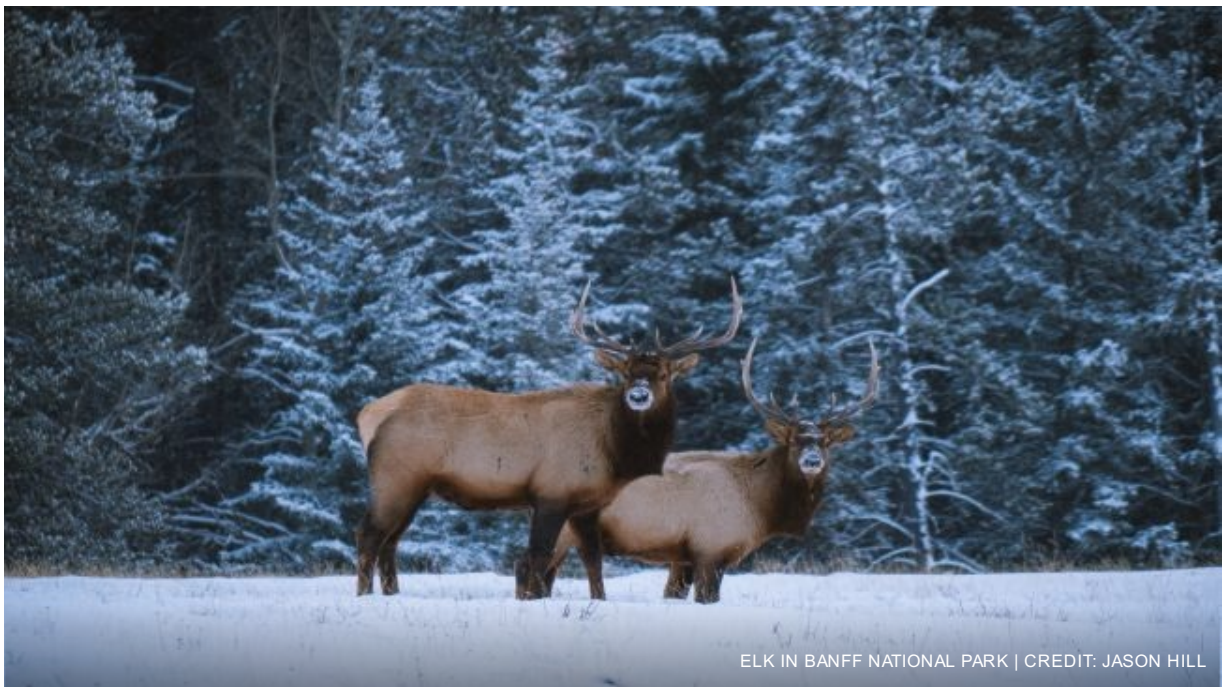
ELK IN BANFF NATIONAL PARK