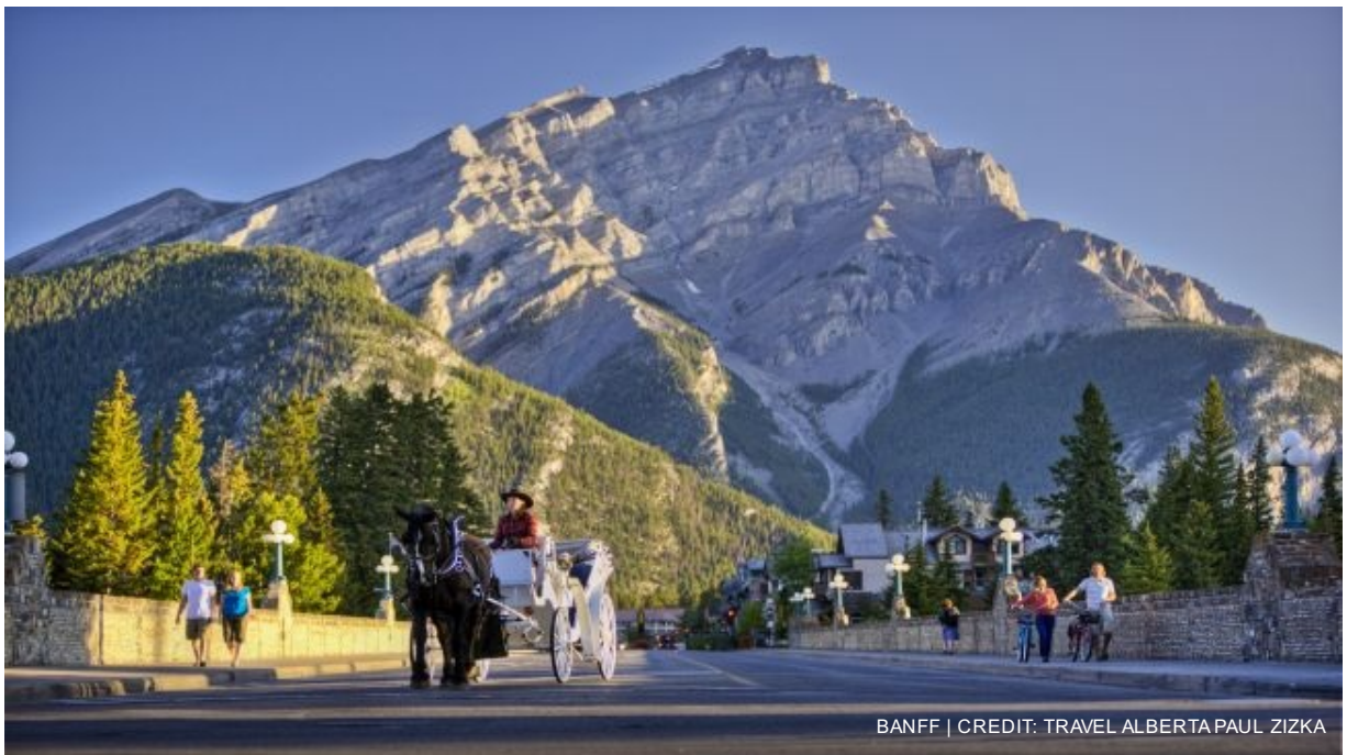
BANFF