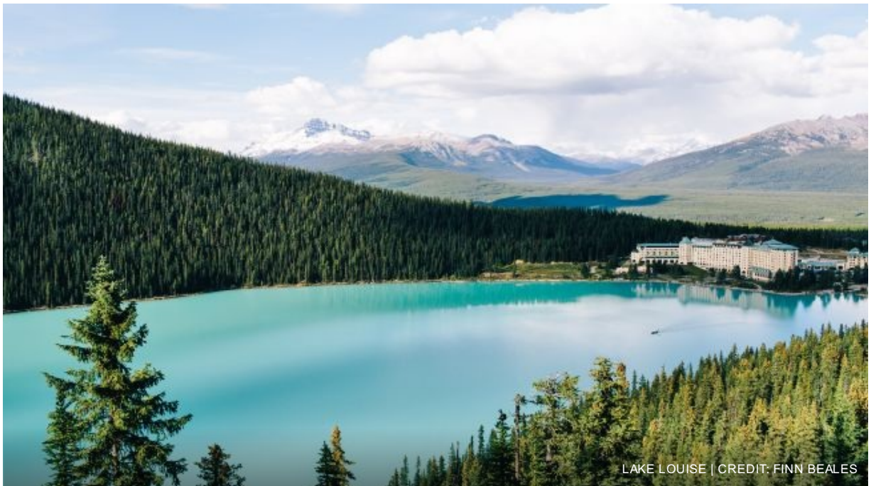
LAKE LOUISE

Overnight in Lake Louise at The Fairmont Chateau Lake Louise