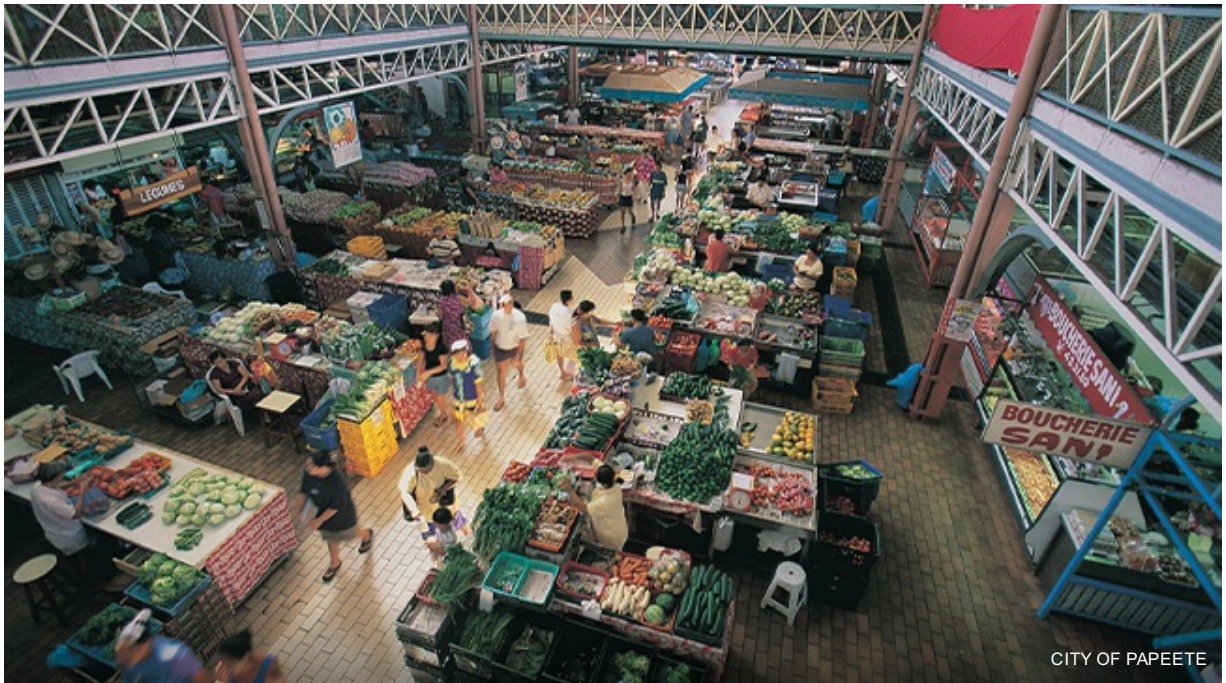
CITY OF PAPEETE