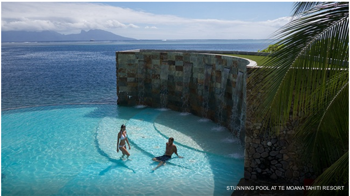
STUNNING POOL AT TE MOANA TAHITI RESORT