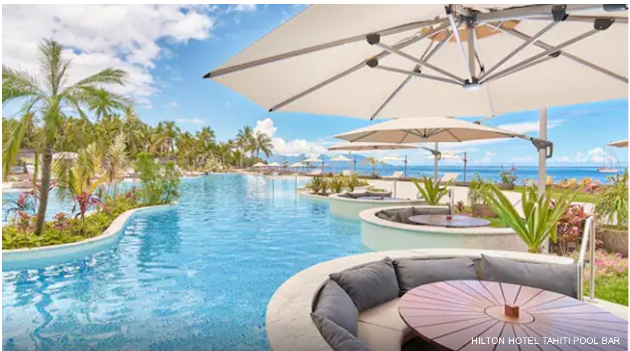
HILTON HOTEL TAHITI POOL BAR