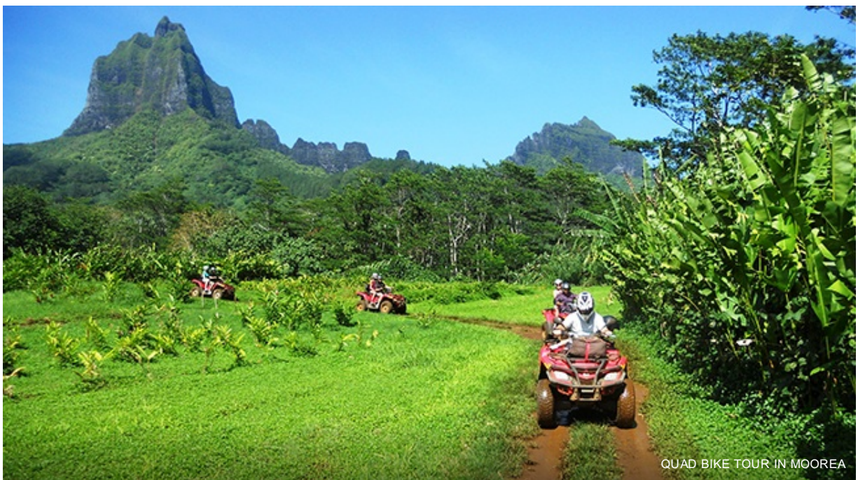
QUAD BIKE TOUR IN MOOREA