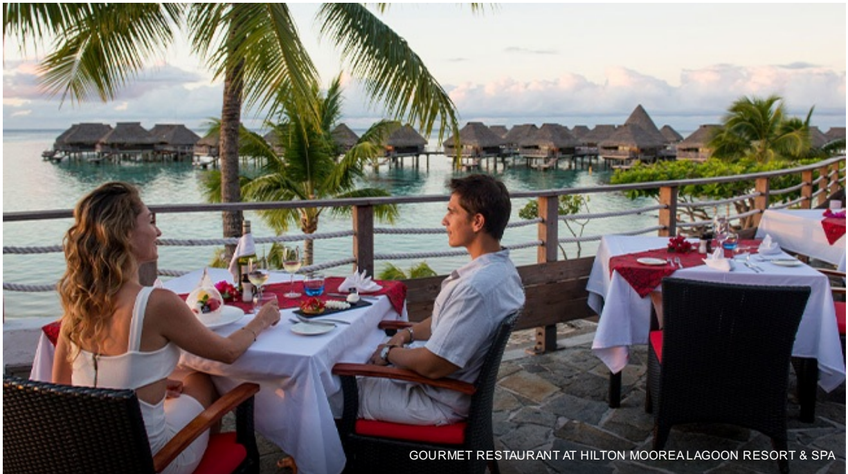
GOURMET RESTAURANT AT HILTON MOOREA LAGOON RESORT & SPA