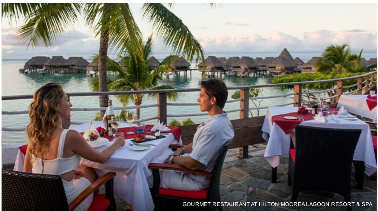
GOURMET RESTAURANT AT HILTON MOOREA LAGOON RESORT & SPA