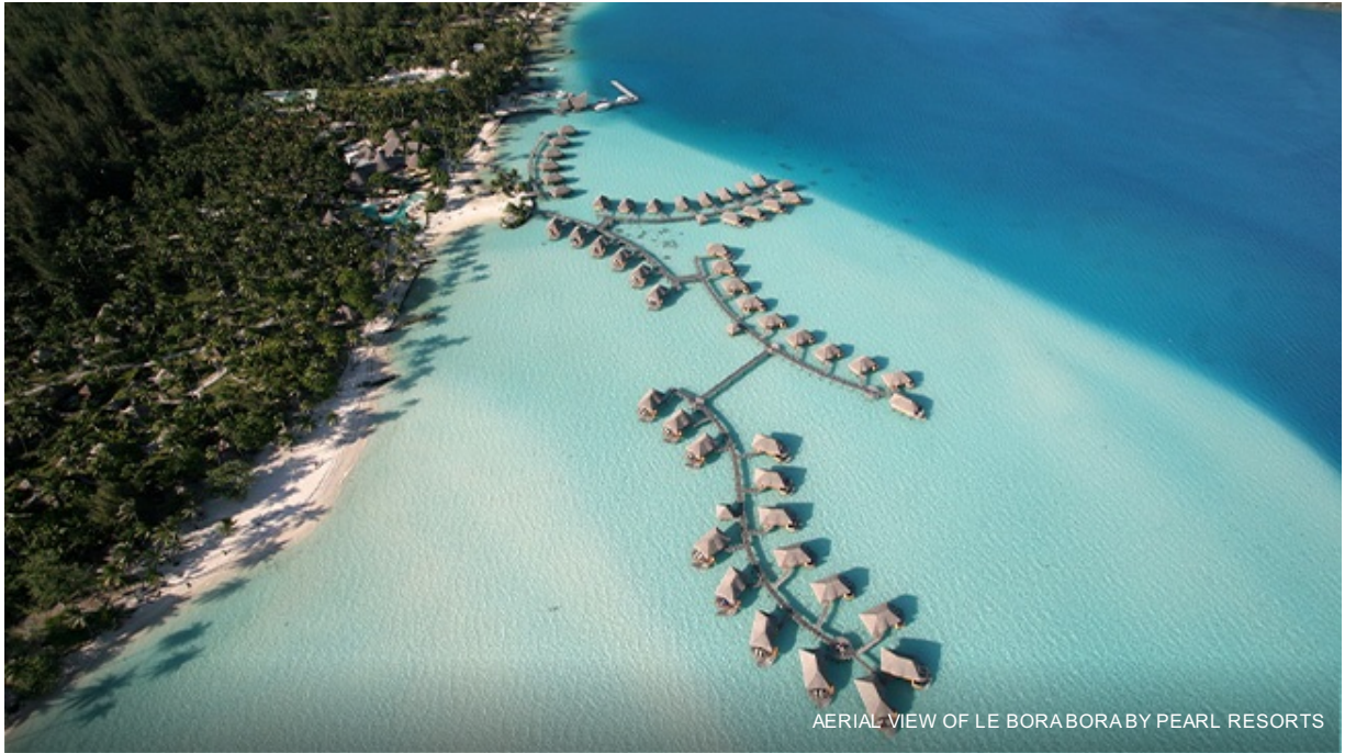
AERIAL VIEW OF LE BORABORABY PEARL RESORTS

Overnight stay in Bora Bora at Le Bora Bora by Pearl Resorts in a Garden Villa & Pool.