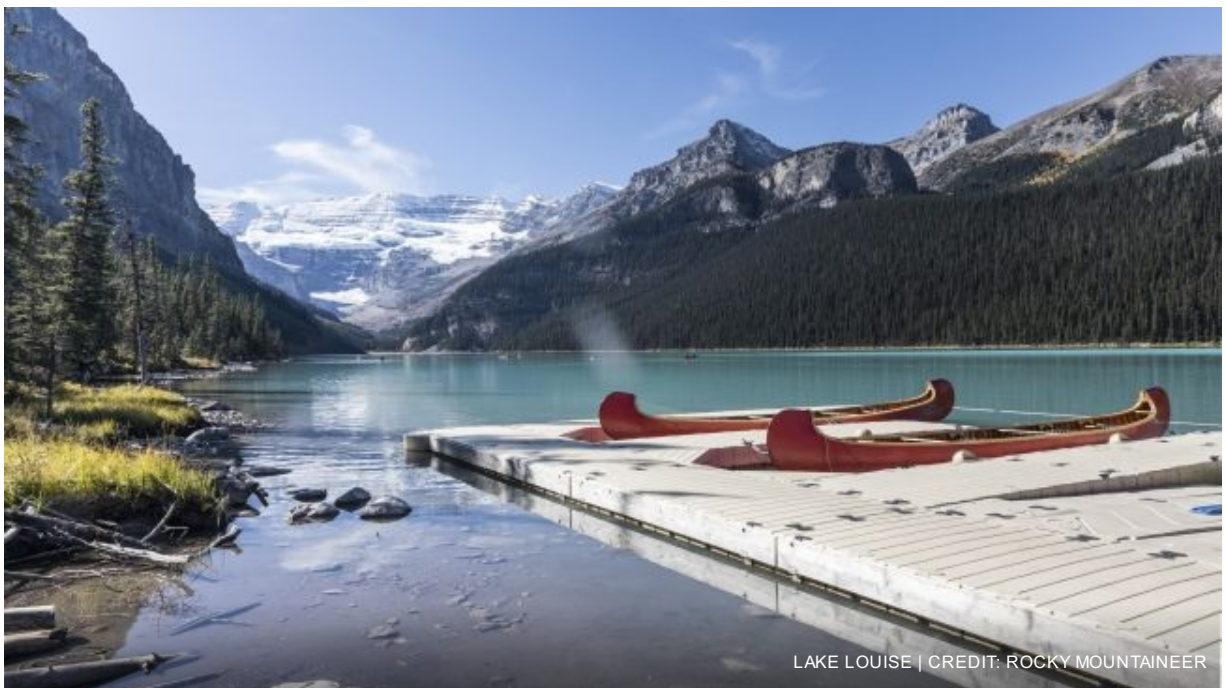
LAKE LOUISE

Overnight in Lake Louise at the Fairmont Chateau Lake Louise