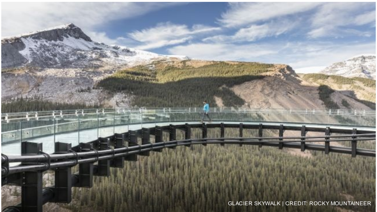
GLACIER SKYWALK