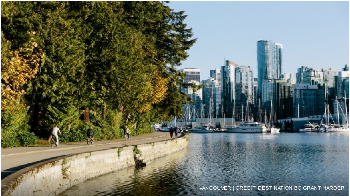
VANCOUVER