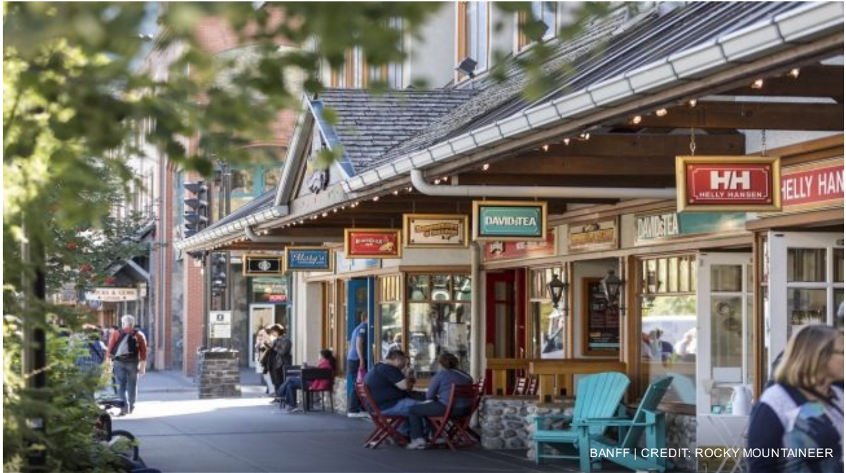
BANFF

Overnight in Banff at the Elk + Avenue Hotel (or similar)