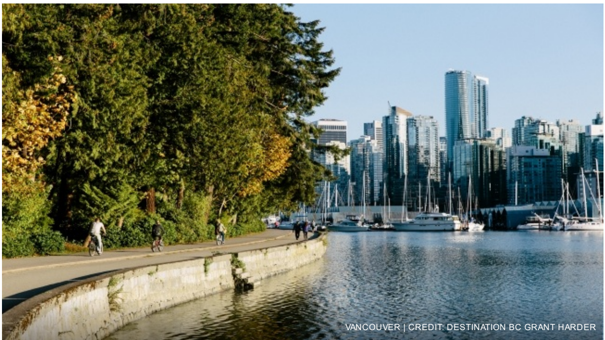
VANCOUVER

Overnight in Vancouver at the Sheraton Wall Centre (or similar)