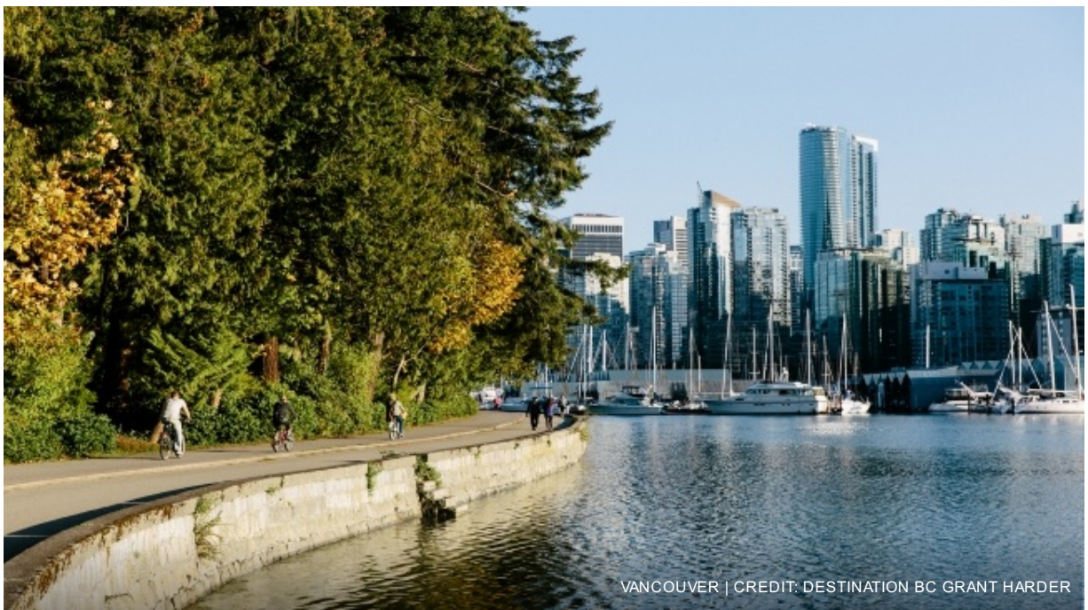
VANCOUVER

Overnight in Vancouver at the Sheraton Wall Centre (or similar)