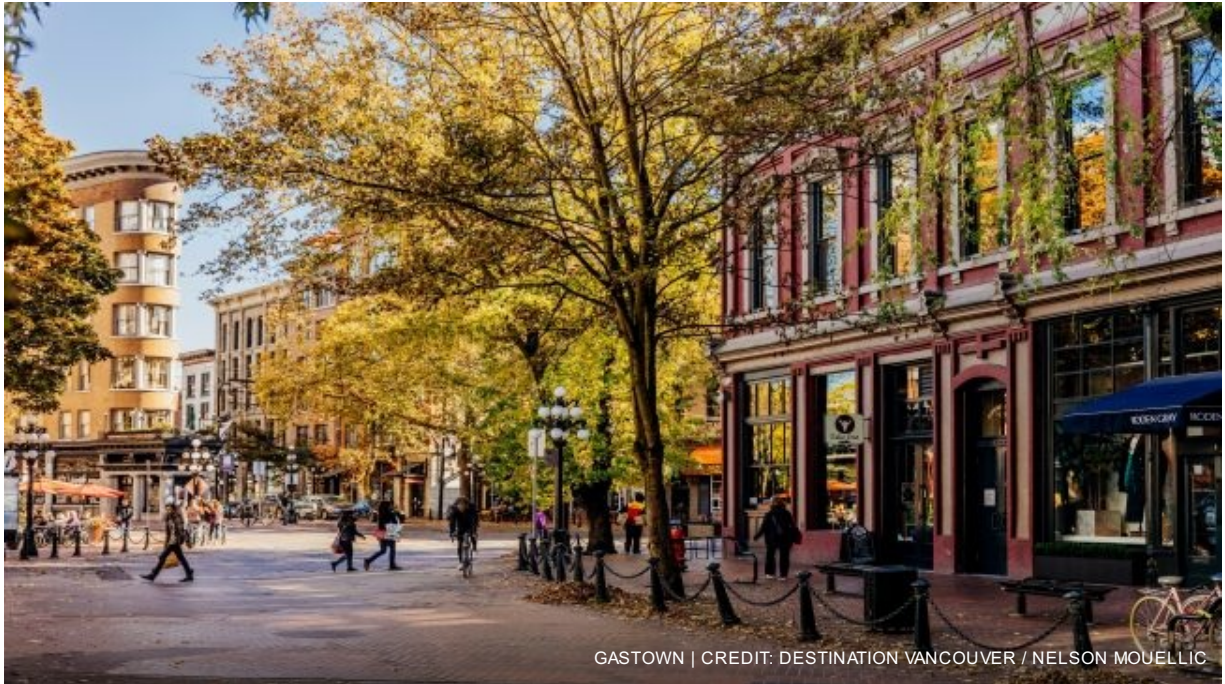
GASTOWN

Overnight in Vancouver at the Sutton Place Hotel (or similar)