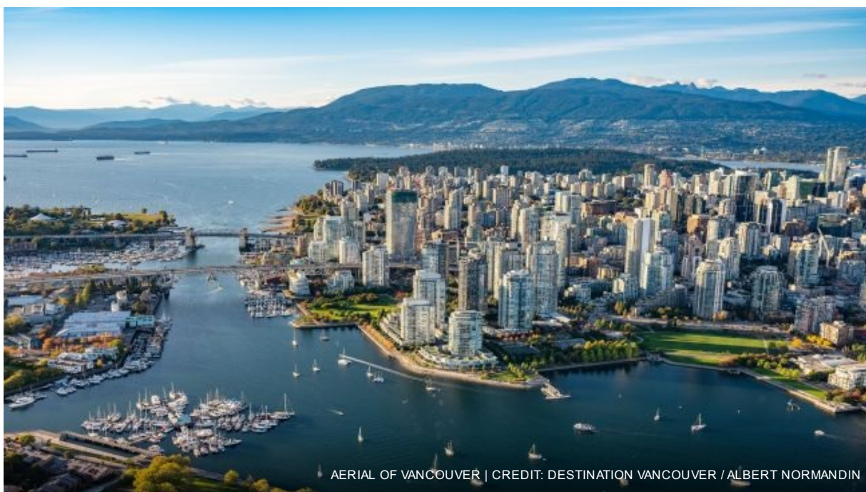
AERIAL OF VANCOUVER

Overnight in Vancouver at the Sutton Place Hotel (or similar)