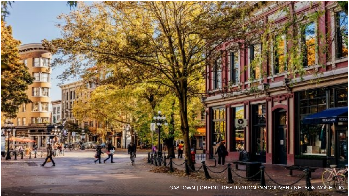
GASTOWN

Overnight in Vancouver at the Sutton Place Hotel (or similar)