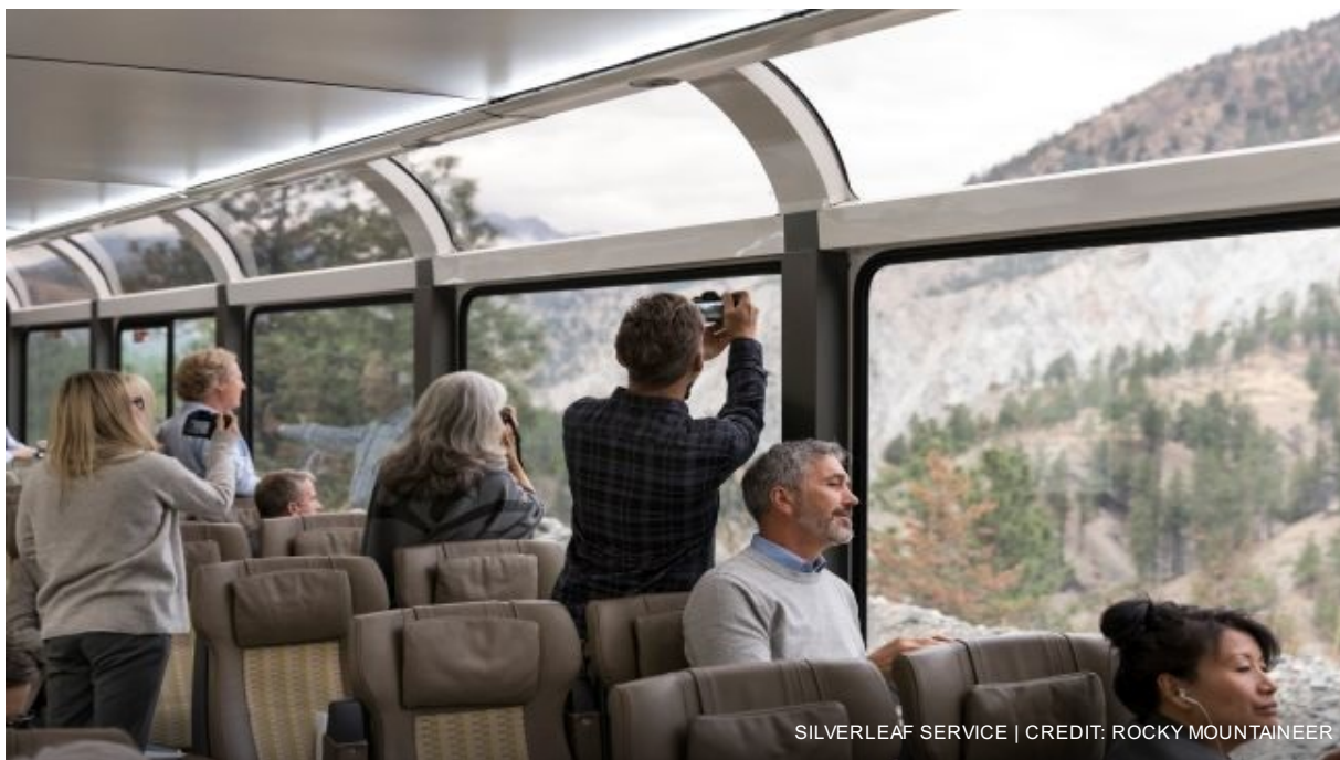
SILVERLEAF SERVICE