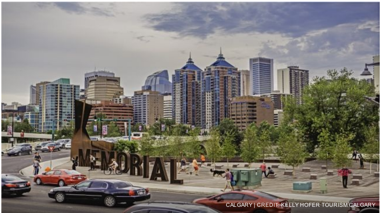
CALGARY

Overnight in Calgary at the Hyatt Regency Calgary