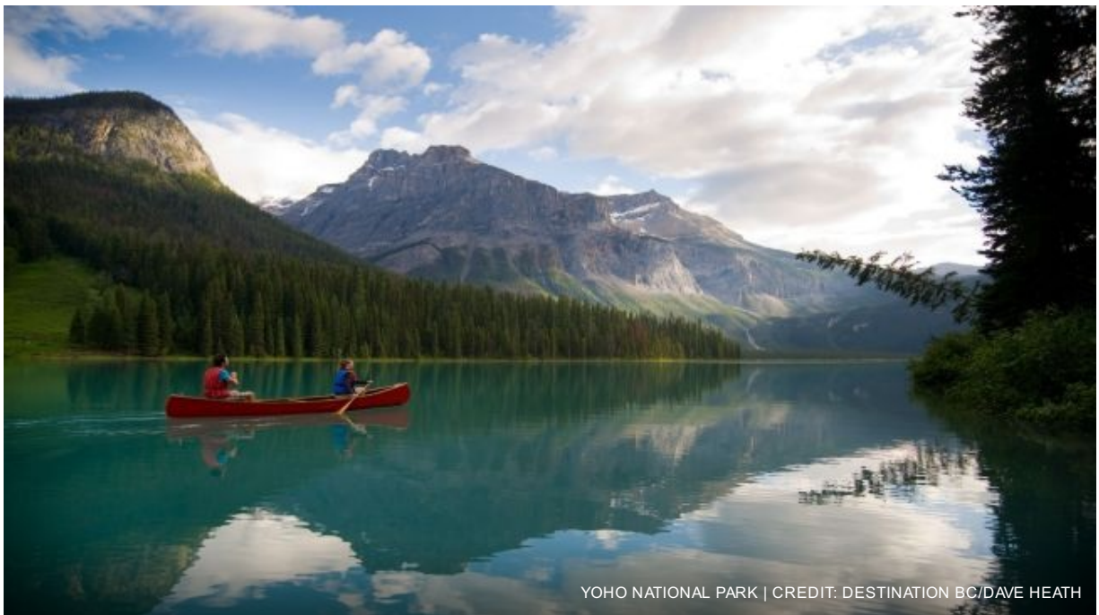
YHO NATIONAL PARK

Overnight in Banff at the Mount Royal Hotel (or similar)