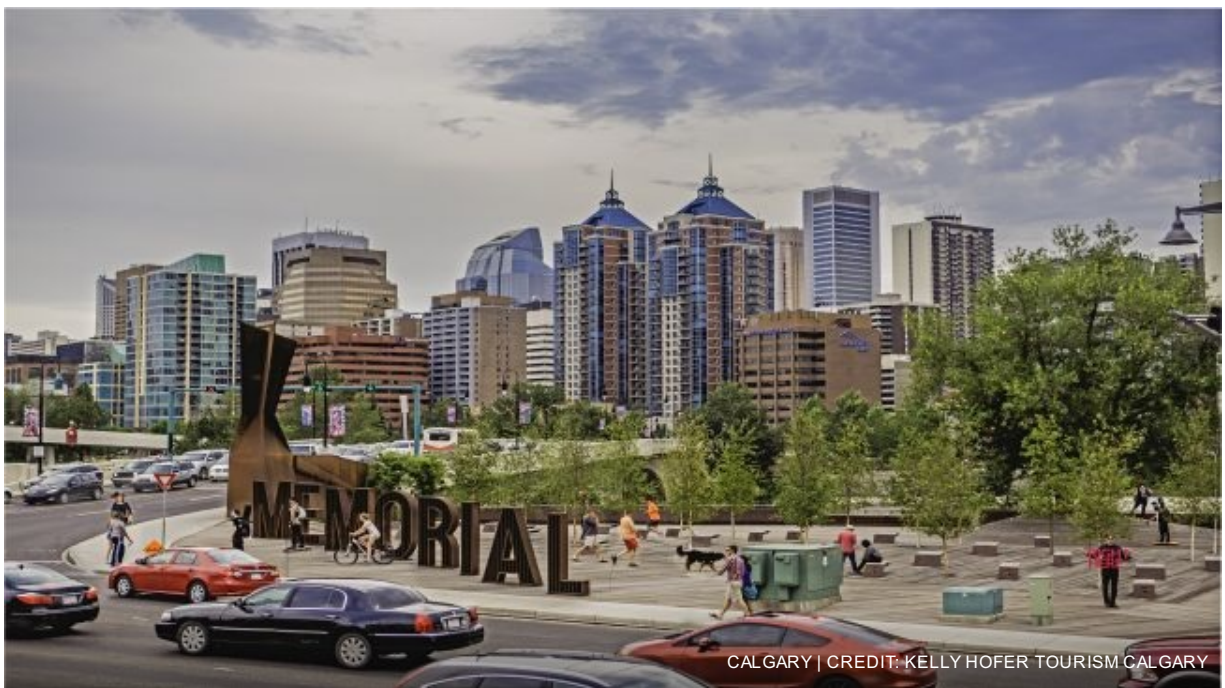
CALGARY

Overnight in Calgary at the Hyatt Regency Calgary