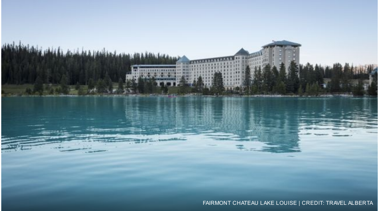
FAIRMONT CHATEAU LAKE LOUISE

Overnight in Lake Louise at the Fairmont Chateau Lake Louise