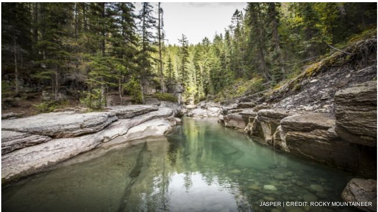
JASPER

Overnight in Jasper at the Fairmont Jasper Park Lodge