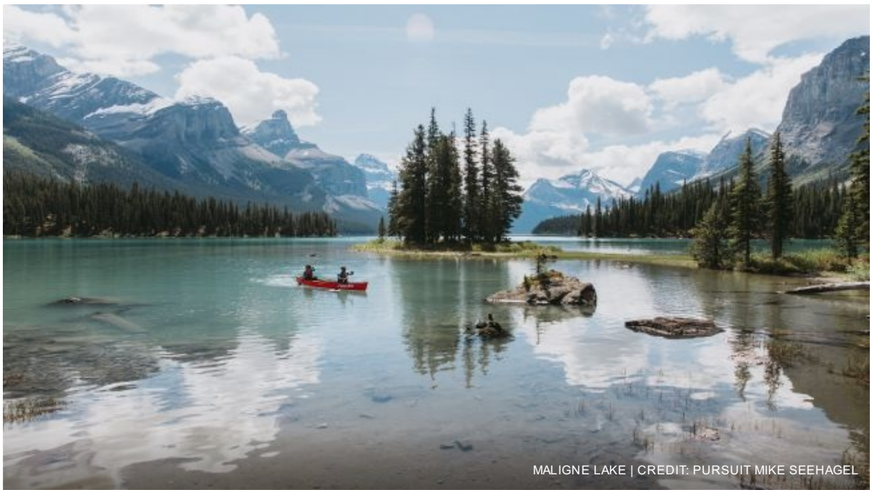
MALIGNE LAKE