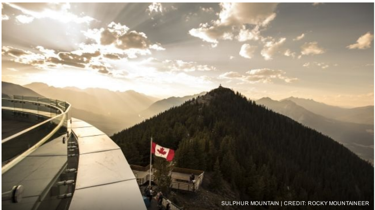
SULPHUR MOUNTAIN

Overnight in Calgary at the Fairmont Palliser (or similar)