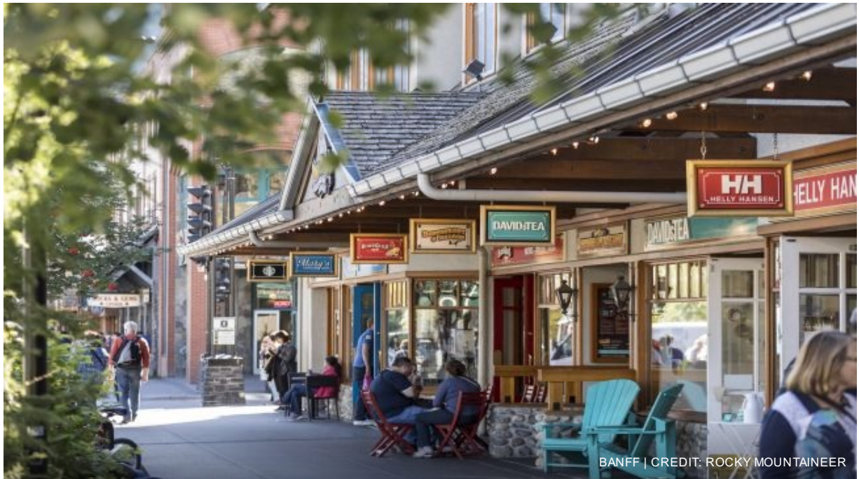
BANFF

Overnight in Banff at the Fairmont Banff Springs (or similar)