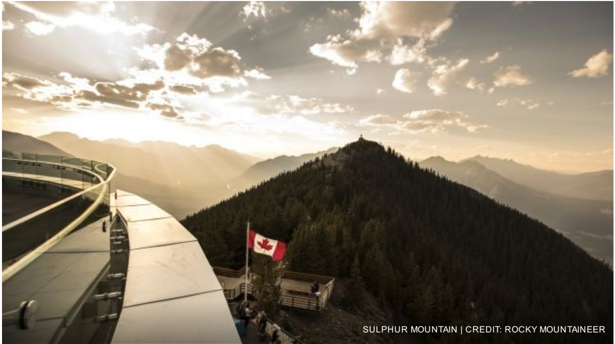
SULPHUR MOUNTAIN

Overnight in Calgary at the Fairmont Palliser (or similar)