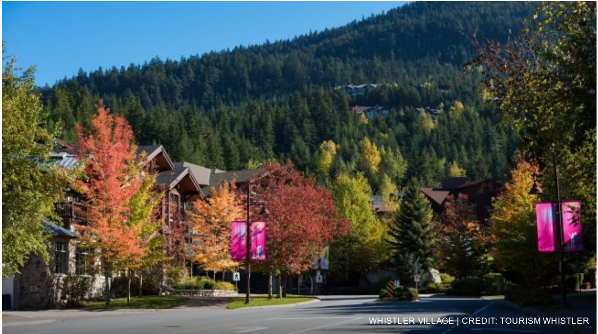
WHISTLER VILLAGE

Today, your journey continues eastward to the majestic Canadian Rockies and Jasper National Park. From Quesnel, Rocky Mountaineer follows the Fraser River north to the town of Prince George, then travels east through the forests of northern British Columbia, home to plentiful wildlife, including a large population of moose, caribou and bears. Upon entering the Rocky Mountain Trench, you are surrounded by the steeply rising Rocky Mountains to the north and the Cariboo Mountains to the south. You'll continue climbing past Mount Robson, at 3,954 metres (12,972 feet), the highest peak in the Canadian Rockies, through Yellowhead Pass into the province of Alberta. Your rail journey ends on arrival in Jasper in the evening.