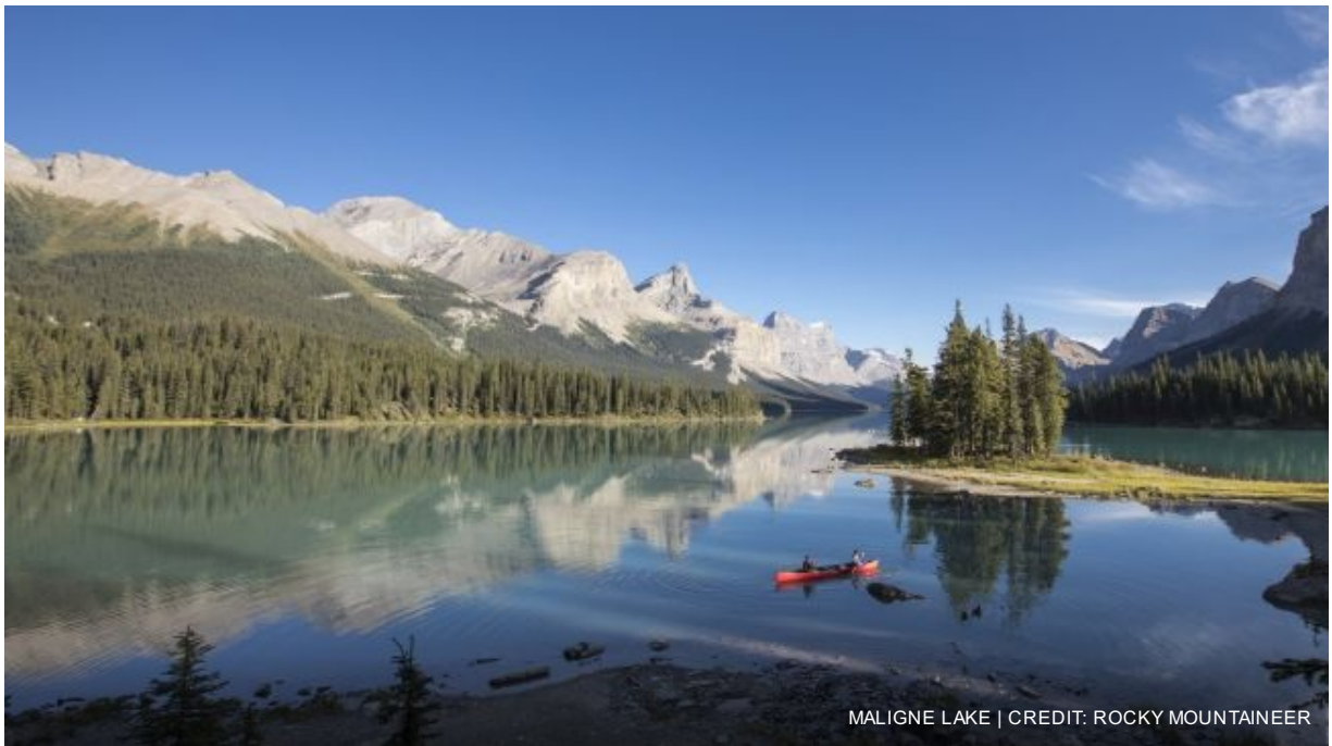
MALIGNE LAKE

Overnight in Jasper at the Fairmont Jasper Park Lodge (or similar)