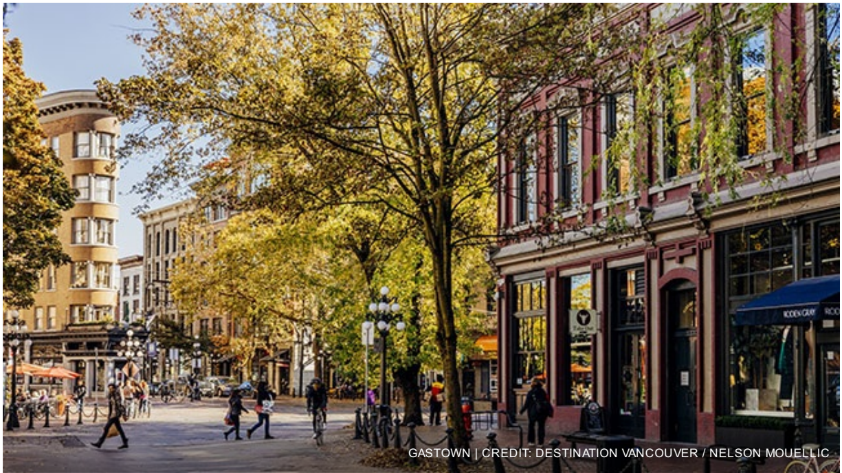
GASTOWN

Overnight in Vancouver at the Sutton Place Hotel (or similar)