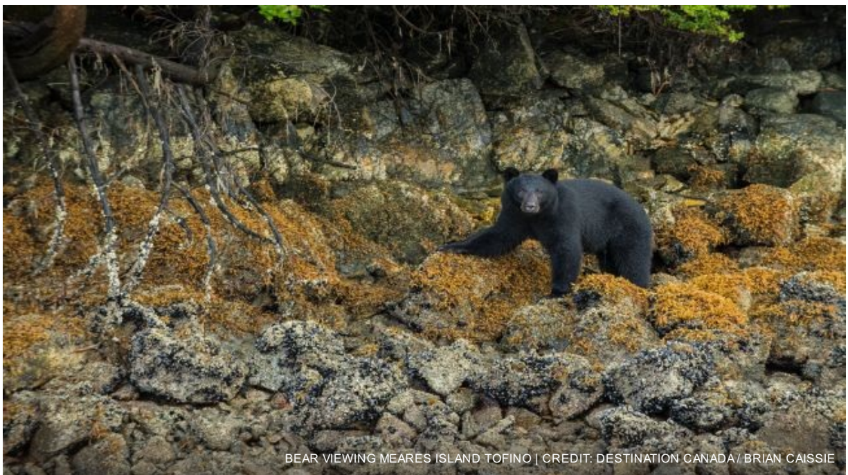
BEAR VIEWING MEARES ISLAND TOFINO

Overnight in Tofino at Pacific Sands Beach Resort (or similar)