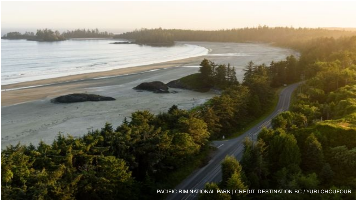
PACIFIC RIM NATIONAL PARK