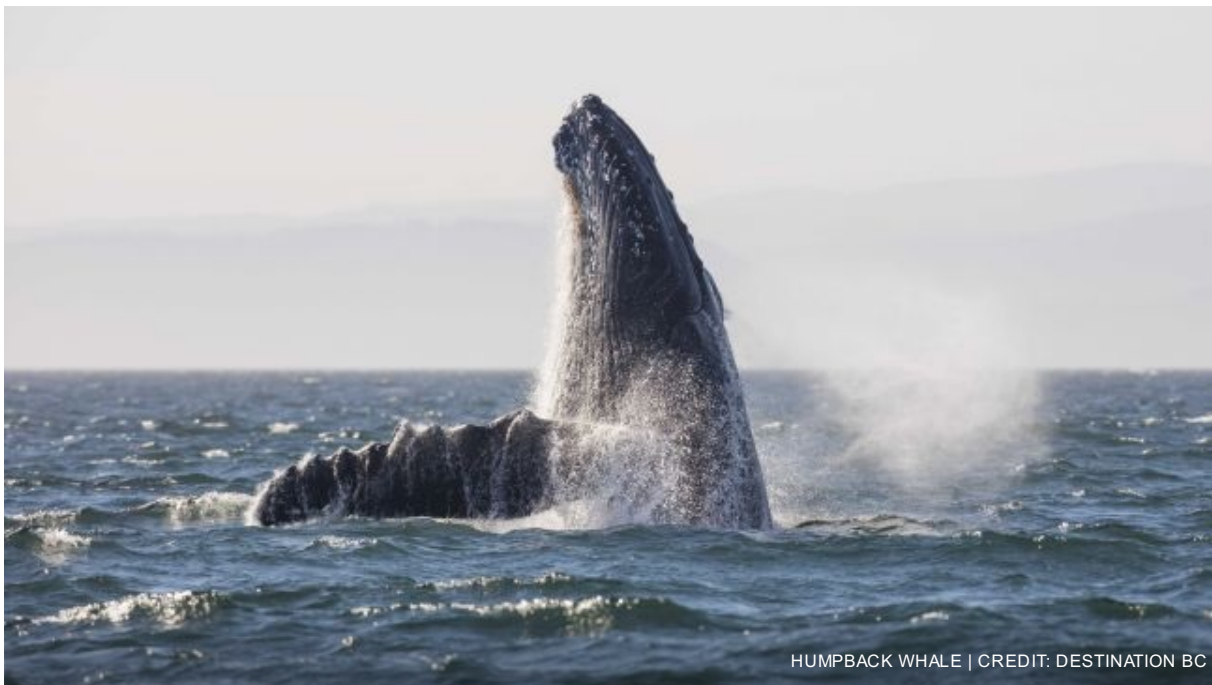
HUMPBACK WHALE

Overnight in Victoria at Inn at Laurel Point (or similar)