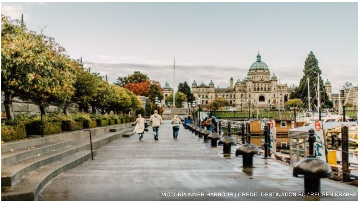
VICTORIA INNER HARBOUR

Overnight in Victoria at the Inn at Laurel Point (or similar)