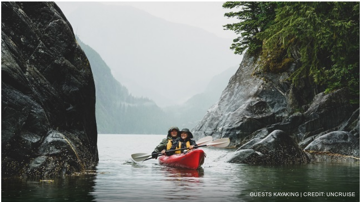
GUESTS KAYAKING