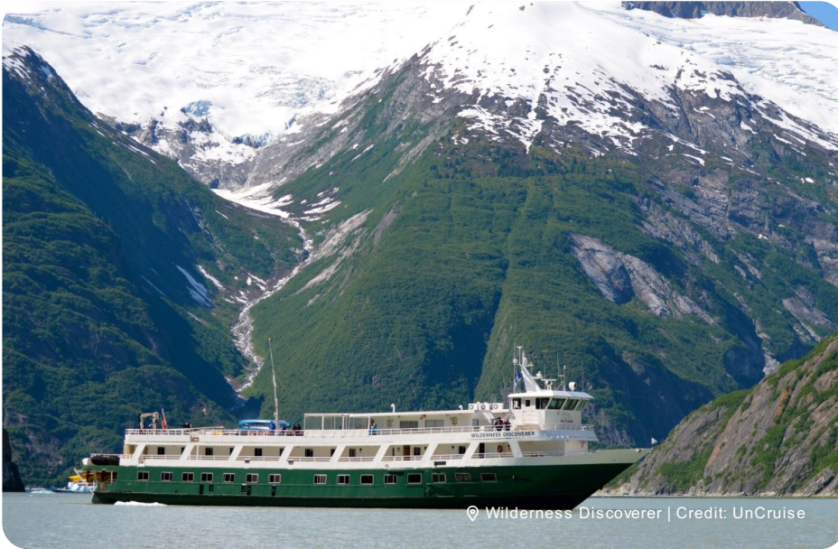
Wilderness Discoverer