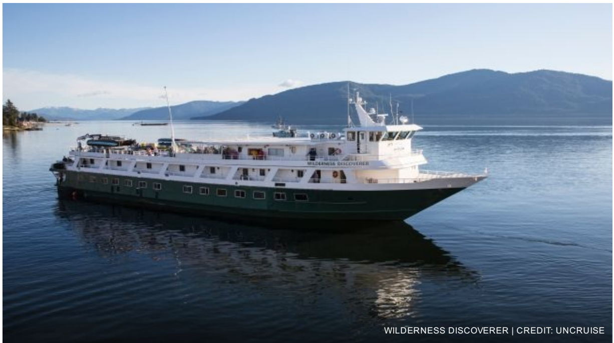
WILDERNESS DISCOVERER

Onboard Features: EZ Dock kayak launch platform; bow-mounted underwater camera; kayaks, paddleboards, inflatable skiffs, hiking poles, snorkel gear/wetsuits; two on-deck hot tubs; fitness equipment and yoga mats; DVD and book library.