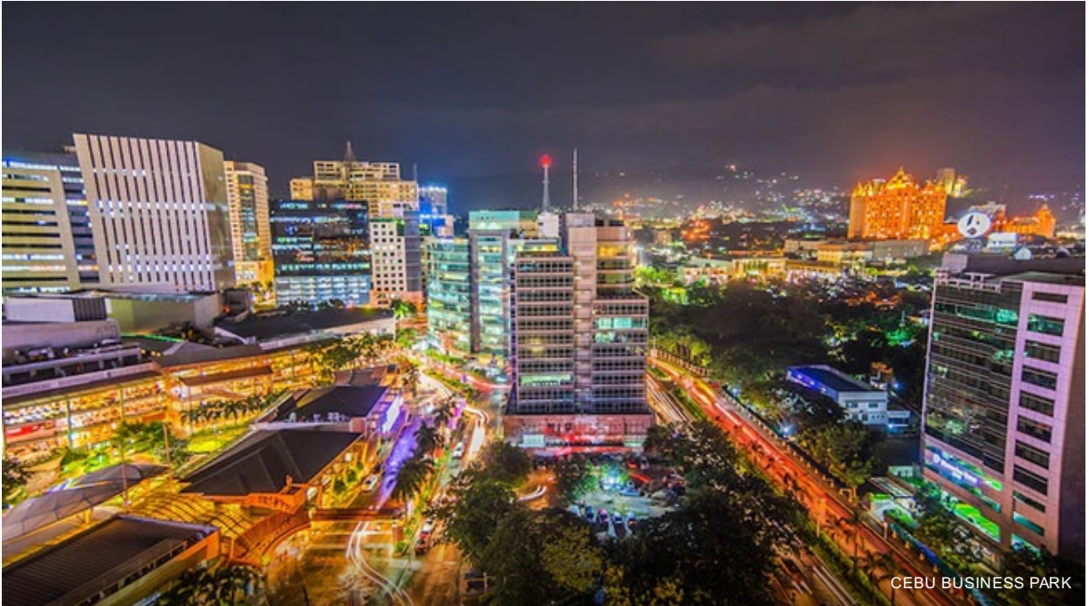
CEBU BUSINESS PARK