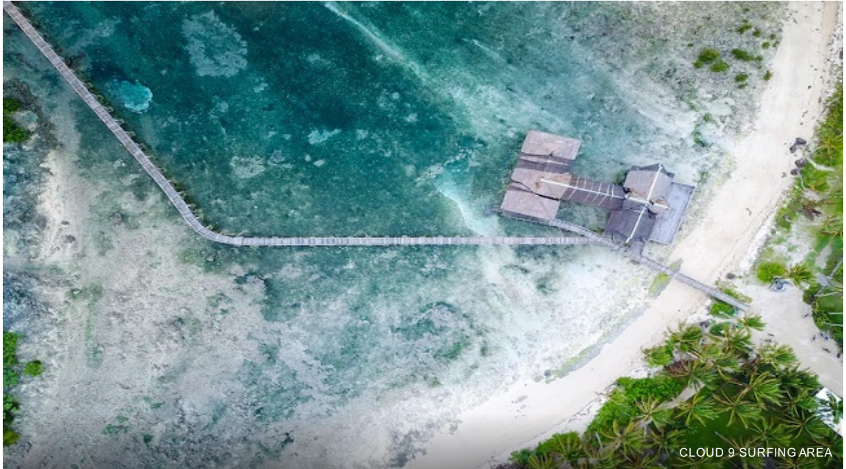
CLOUD 9 SURFING AREA