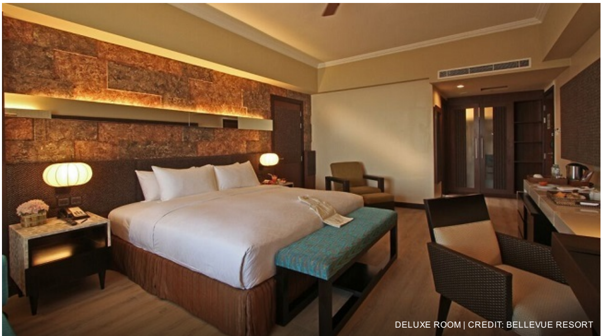
DELUXE ROOM | CREDIT: BELLEVUE RESORT

Overnight stay at Bellevue Resort in a Deluxe Room