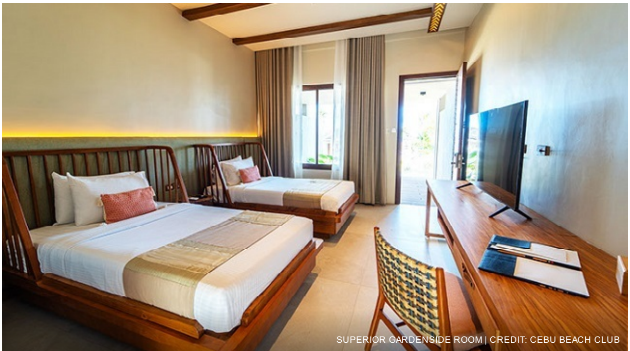
SUPERIOR GARDENSIDE ROOM