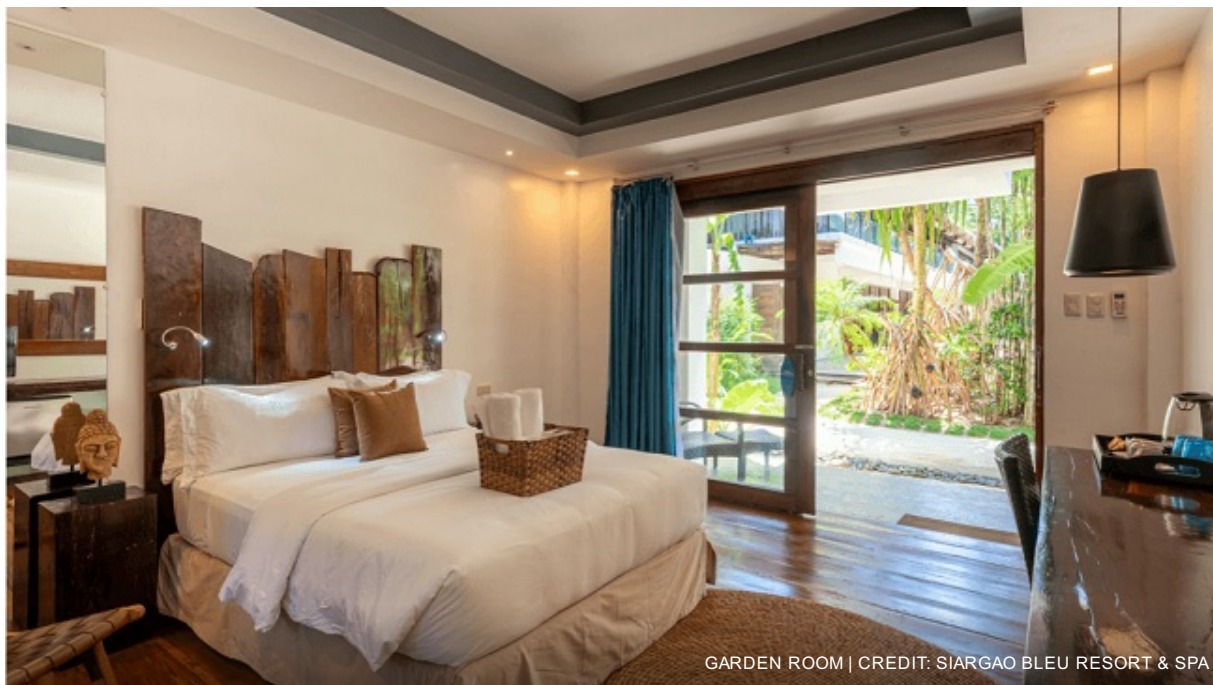
GARDEN ROOM