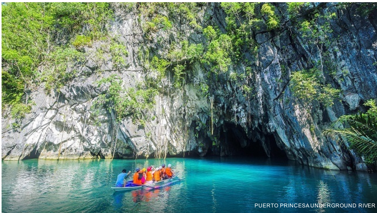
PUERTO PRINCESA UNDERGROUND RIVER