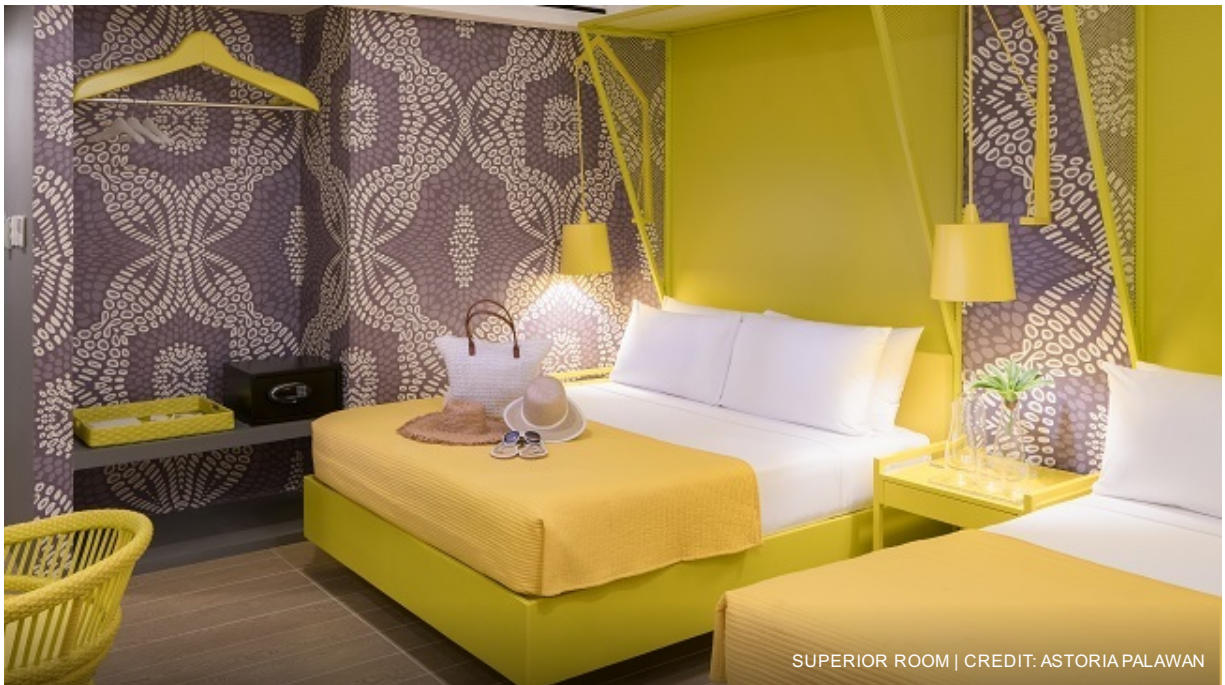
SUPERIOR ROOM | CREDIT: ASTORIA PALAWAN

Overnight stay at Astoria Palawan in a Superior Room.