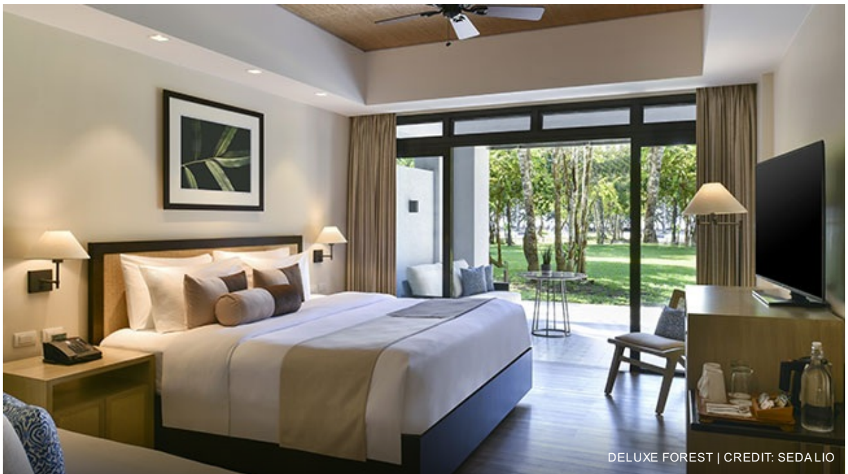
DELUXE FOREST