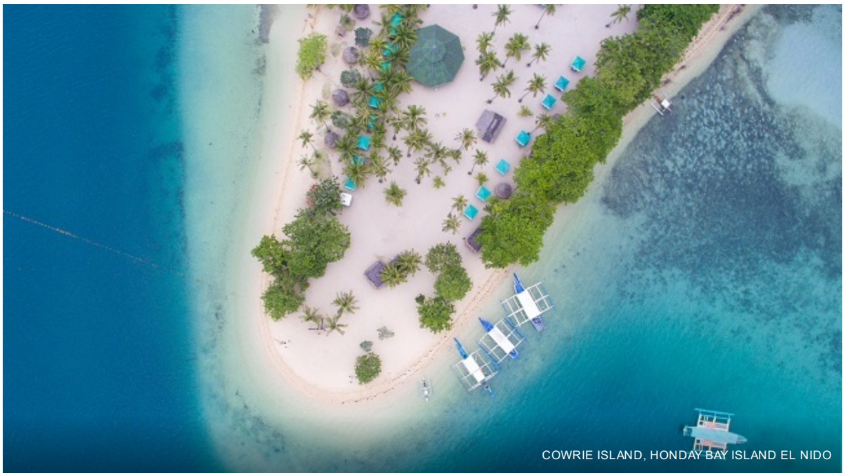
COWRIE ISLAND, HONDAY BAY ISLAND EL NIDO