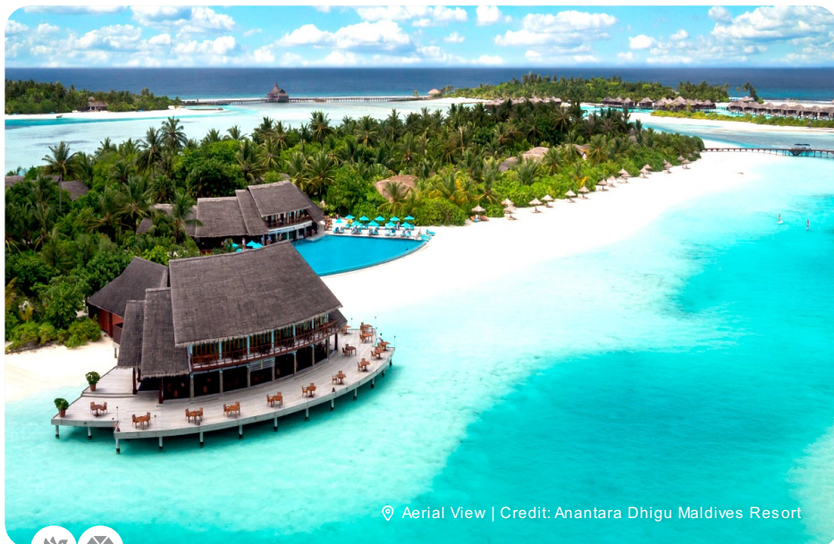
📍 Aerial View