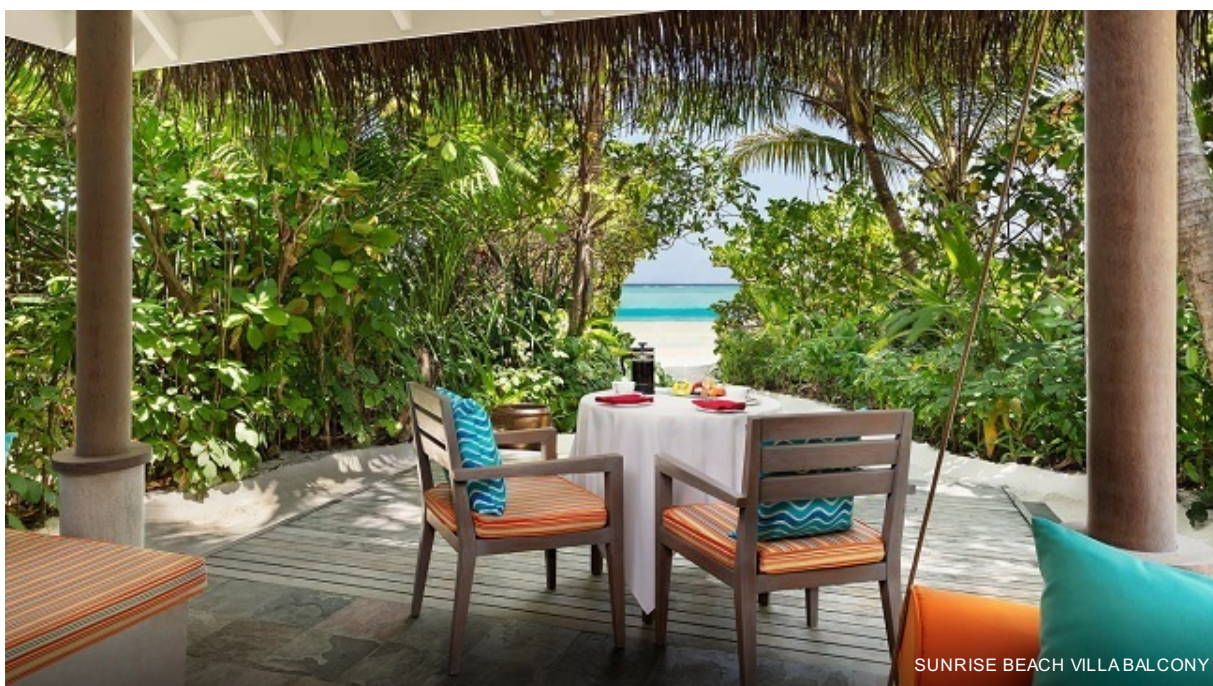
SUNRISE BEACH VILLA BALCONY