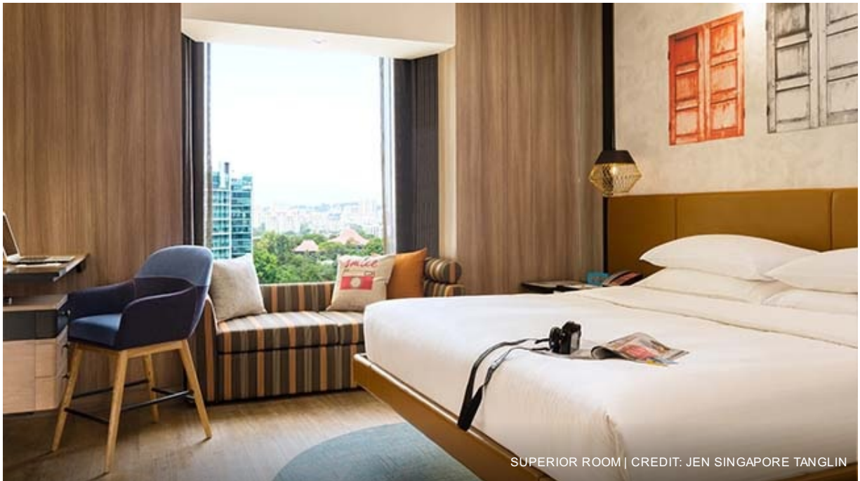
SUPERIOR ROOM

Overnight stay at JEN Singapore Tanglin by Shangri-la in a Superior room.