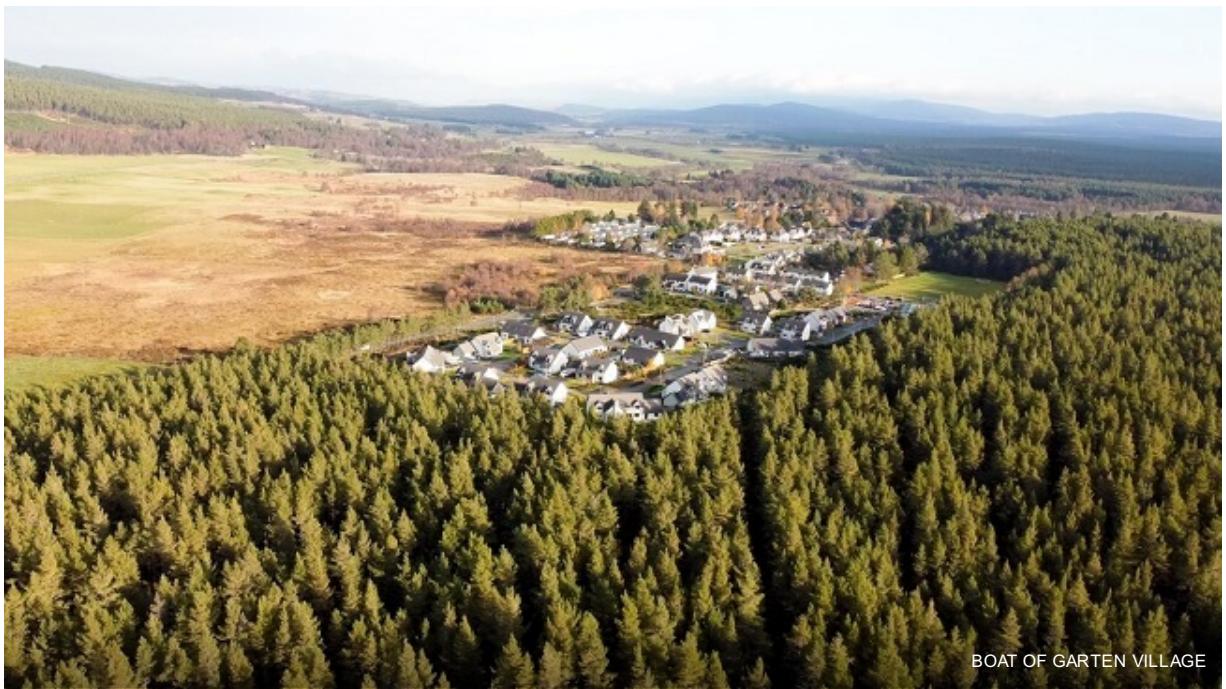
BOAT OF GARTEN VILLAGE