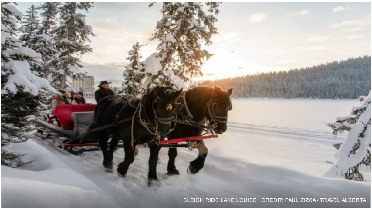
SLEIGH RIDE LAKE LOUISE