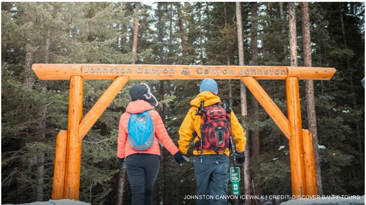
JOHNSTON CANYON ICEWALK