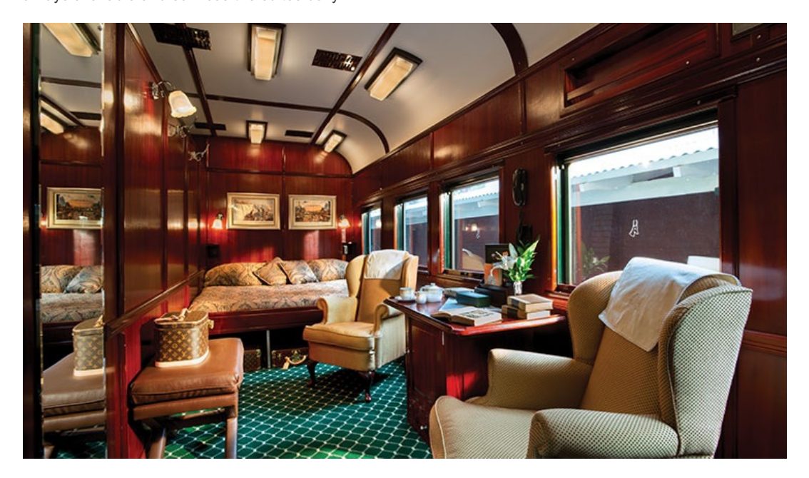
\hbox{Prices are dynamic based on travel dates. Please proceed to } \hbox{Book Now or Contact Us for details.} \\

The wood-panelled sleeper coaches, remodelled and refurbished to mint condition, offer every modern convenience and comfort with fittings and facilities that are of the highest standard. The Royals each take up half a carriage with their own private lounge area and en-suite bathroom with Victorian bath, separate shower, toilet and basin. They accommodate one or two passengers in double or twin beds. A dedicated host/ess is always available and services the suites daily.