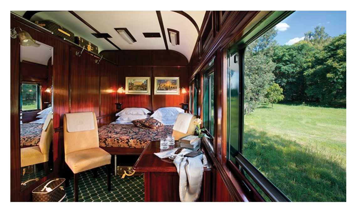
Prices are dynamic based on travel dates. Please proceed to Book Now or Contact Us for details.