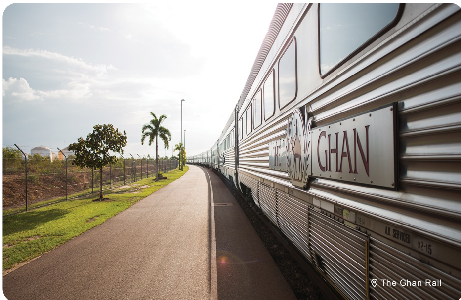
The Ghan Rail