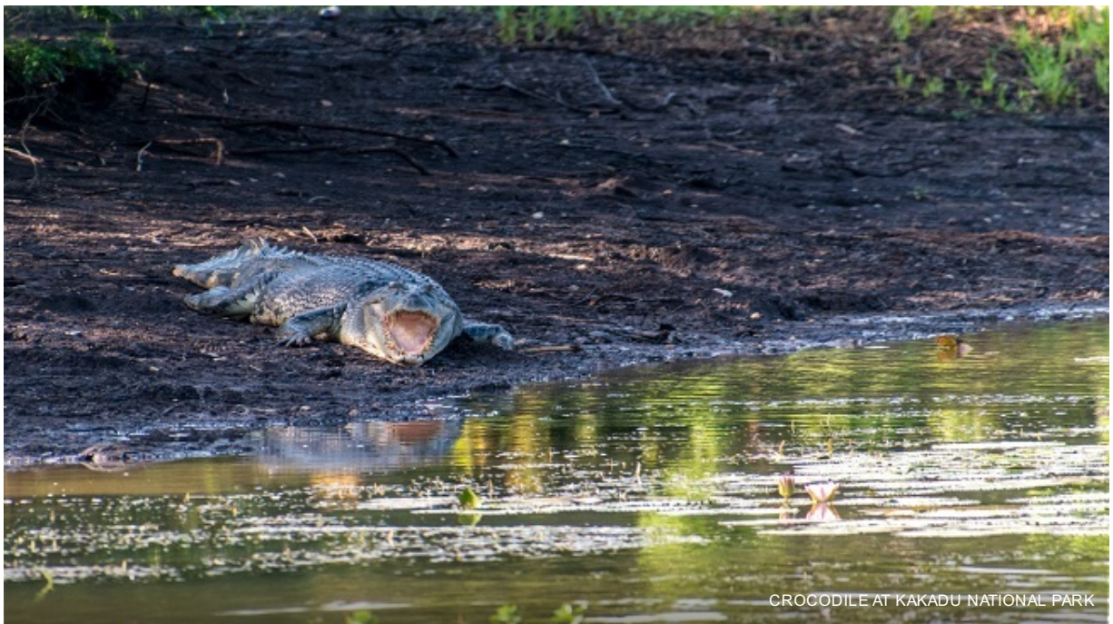
CROCODILE AT KAKADU NATIONAL PARK