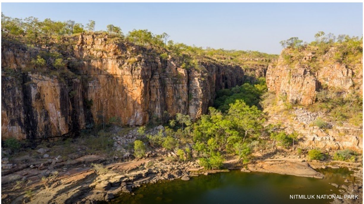
NITMILUK NATIONAL PARK