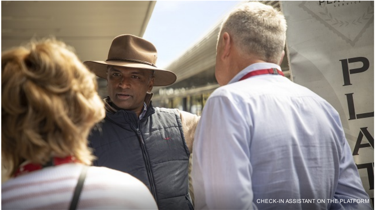
CHECK-IN ASSISTANT ON THE PLATFORM