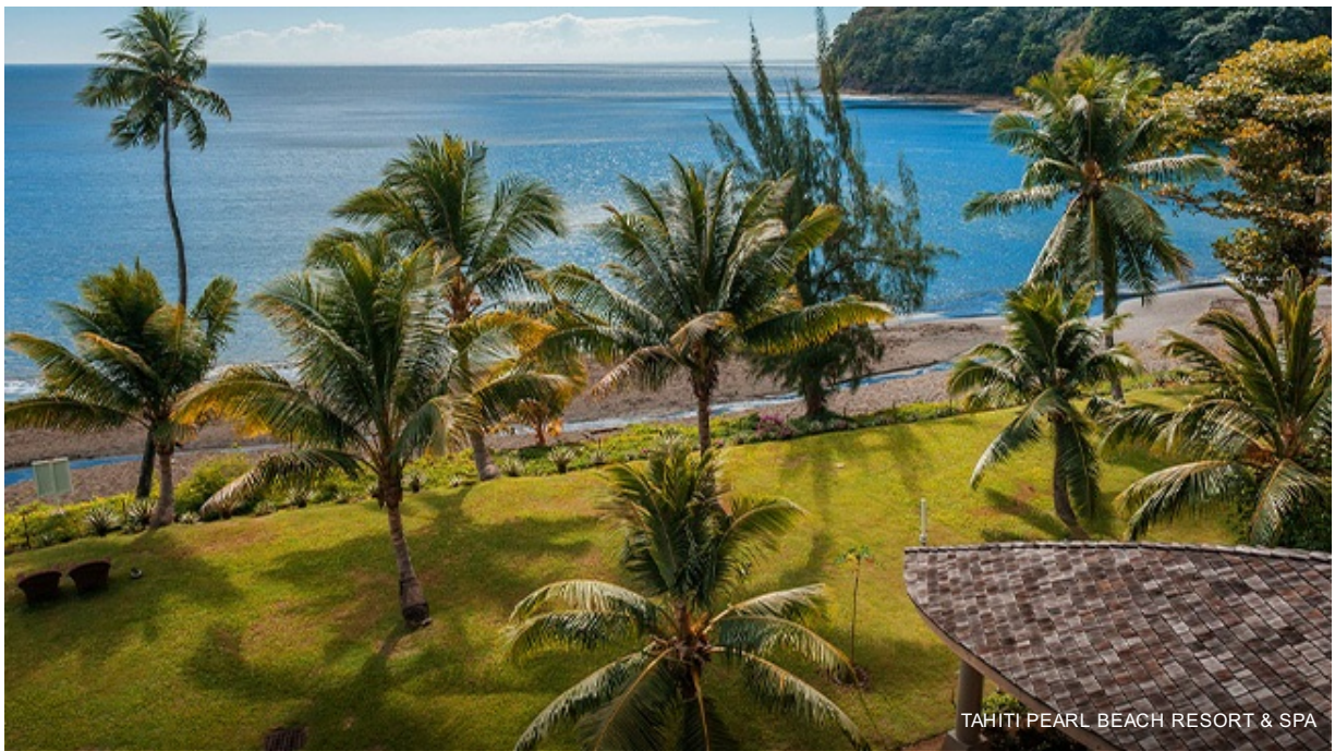
TAHITI PEARL BEACH RESORT & SPA