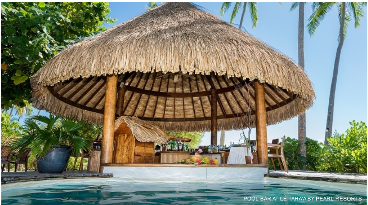
POOL BAR AT LE TAHA'A BY PEARL RESORTS

Overnight stay in Taha'a at Le Taha'a by Pearl Resorts in Pool Beach Villa.