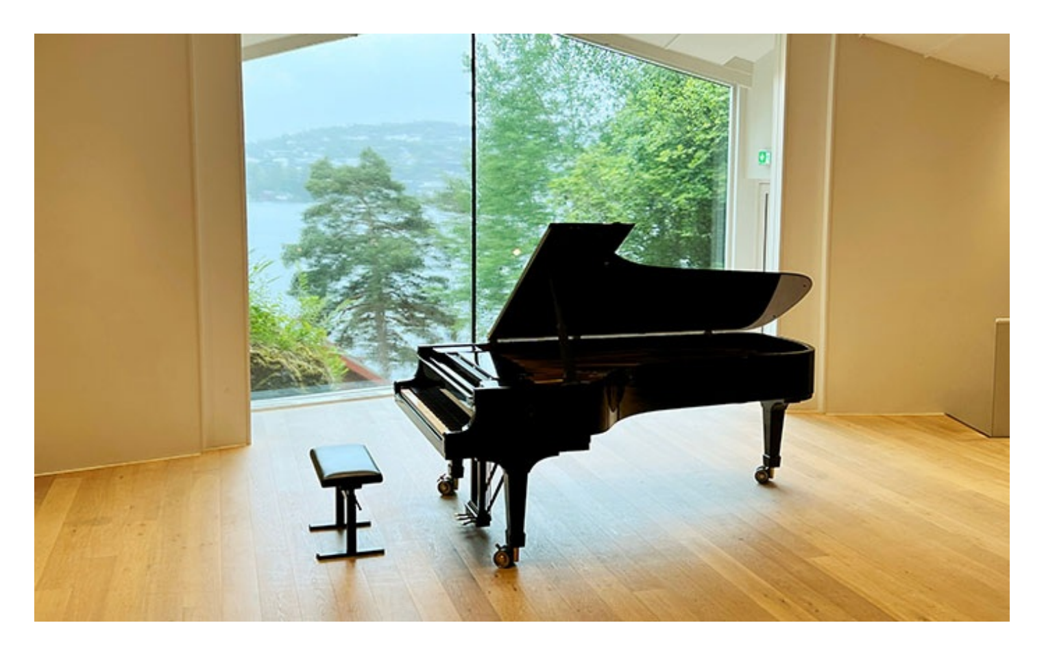
2.5 - 3 hours