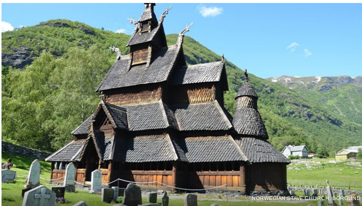
NORWEGIAN STAVE CHURCH, BORGUND