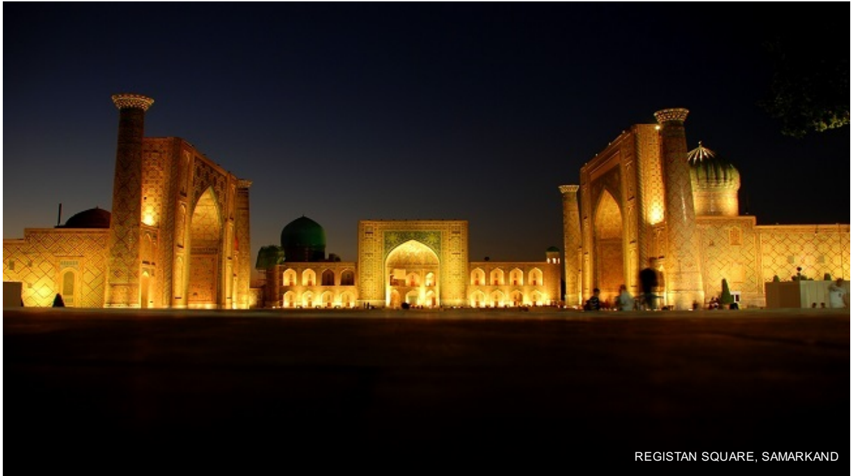
REGISTAN SQUARE, SAMARKAND