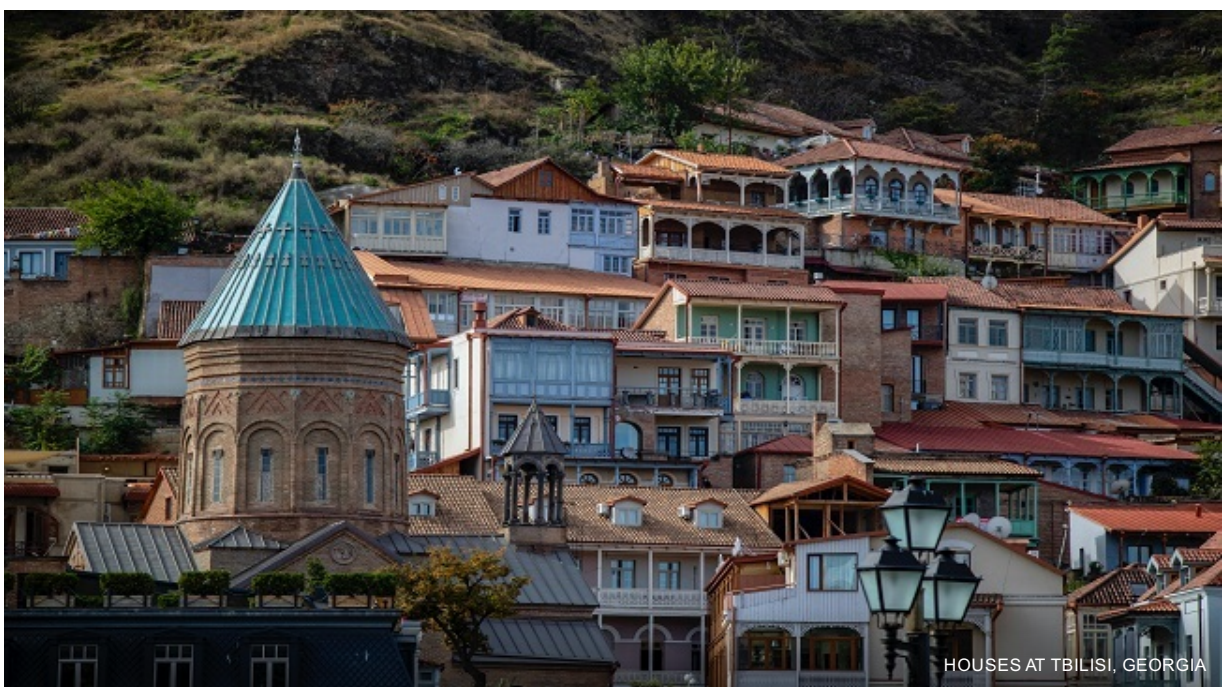
HOUSES AT TBILISI, GEORGIA