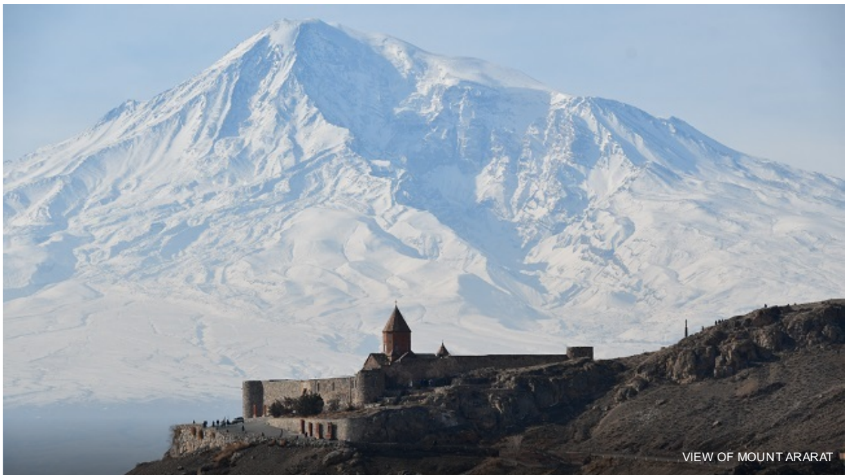
VIEW OF MOUNT ARARAT