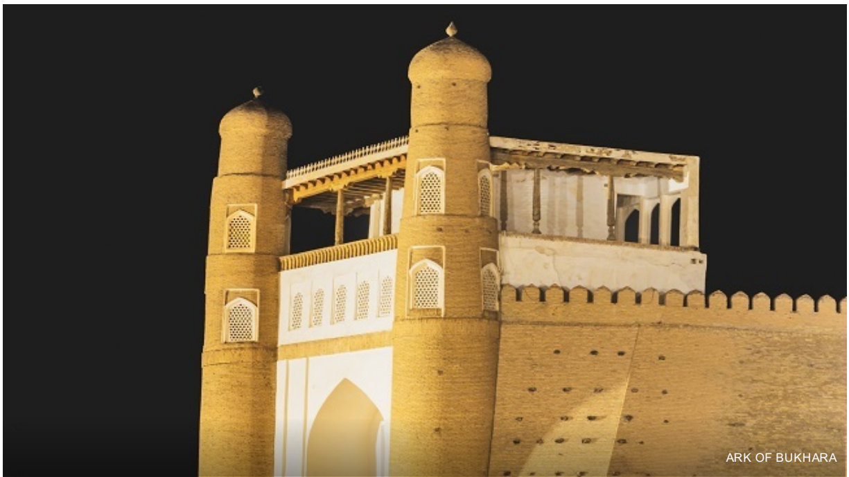
ARK OF BUKHARA