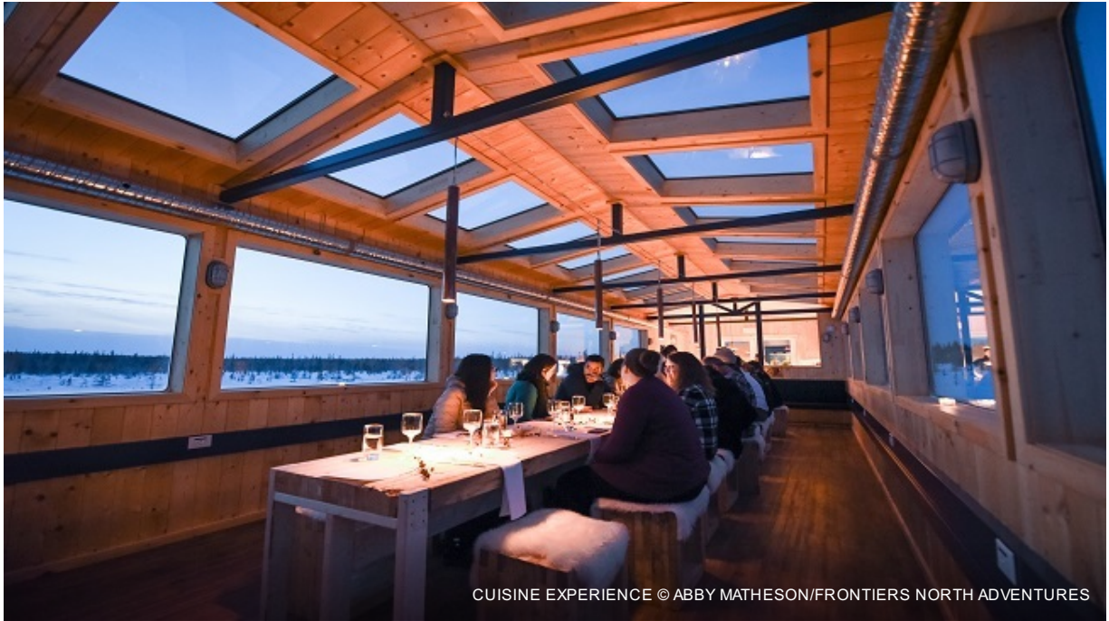
CUISINE EXPERIENCE