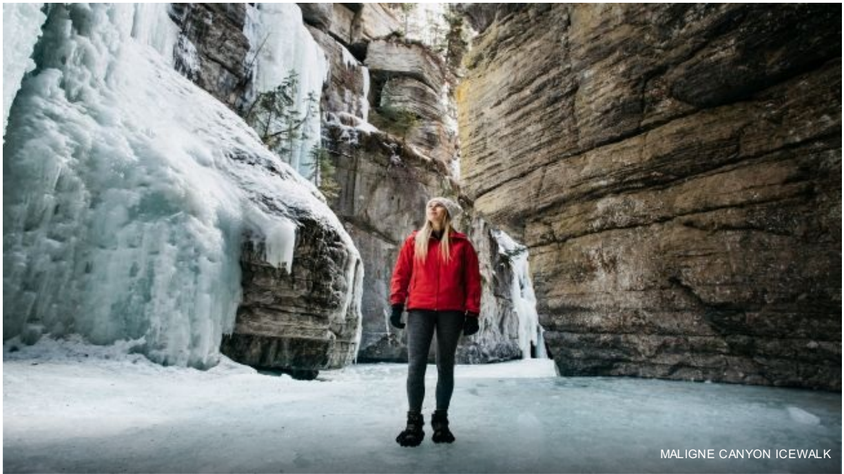
MALIGNE CANYON ICEWALK