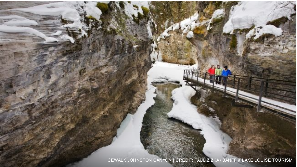
ICEWALK JOHNSTON CANYON