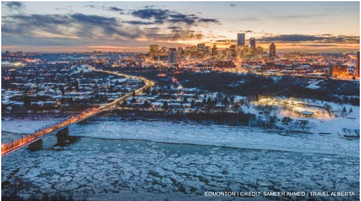
EDMONTON | CREDIT: SAMEER AHMED / TRAVEL ALBERTA

Overnight in Edmonton at The Sandman Signature Downtown Hotel