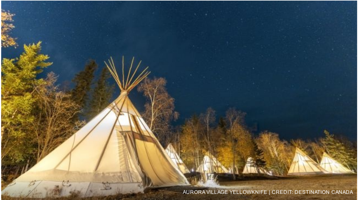
AURORA VILLAGE YELLOWKNIFE

Overnight in Yellowknife at The Explorer Hotel