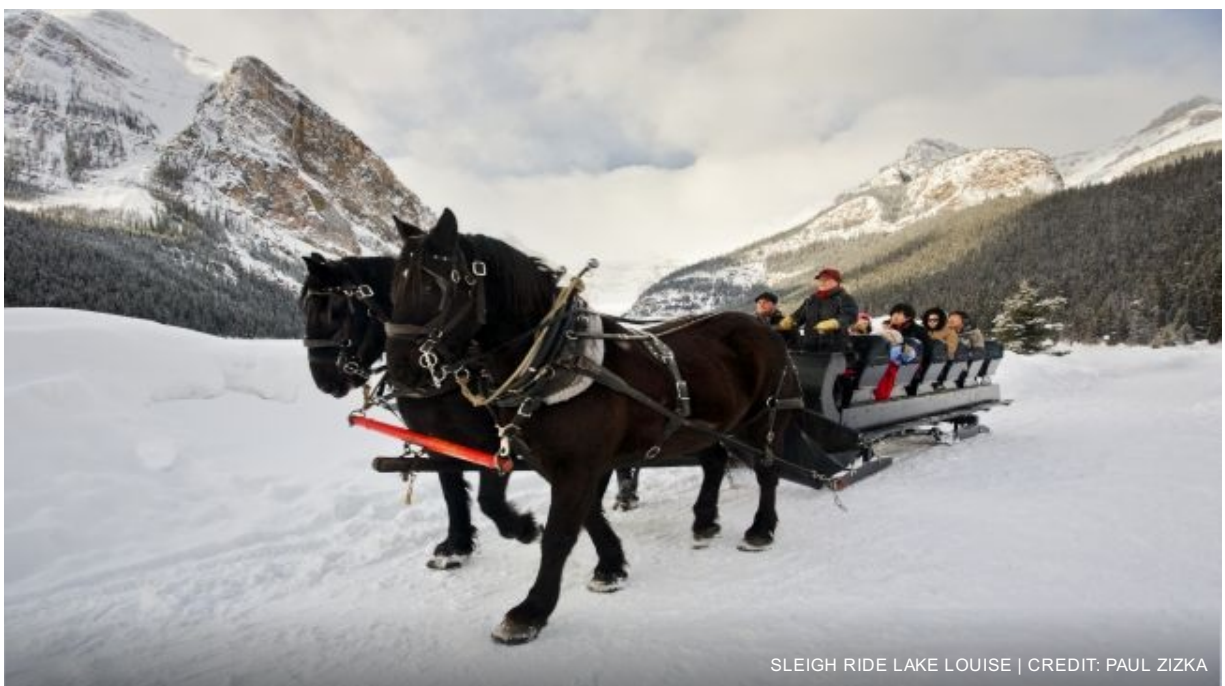
SLEIGH RIDE LAKE LOUISE

Overnight in Lake Louise at The Fairmont Chateau Lake Louise