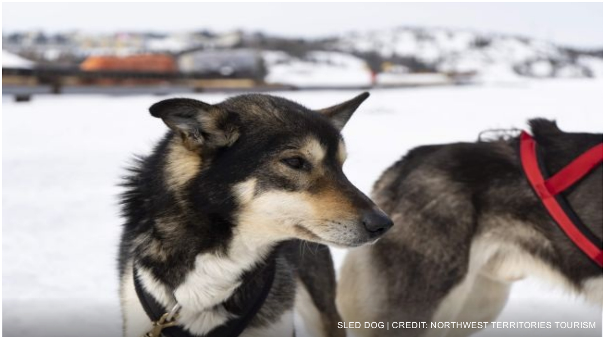
SLED DOG

Overnight in Yellowknife at The Explorer Hotel