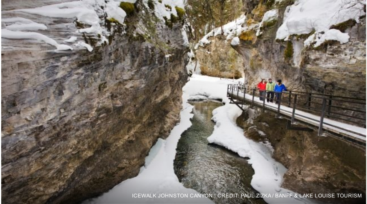
ICEWALK JOHNSTON CANYON

Overnight in Banff at The Mount Royal Hotel