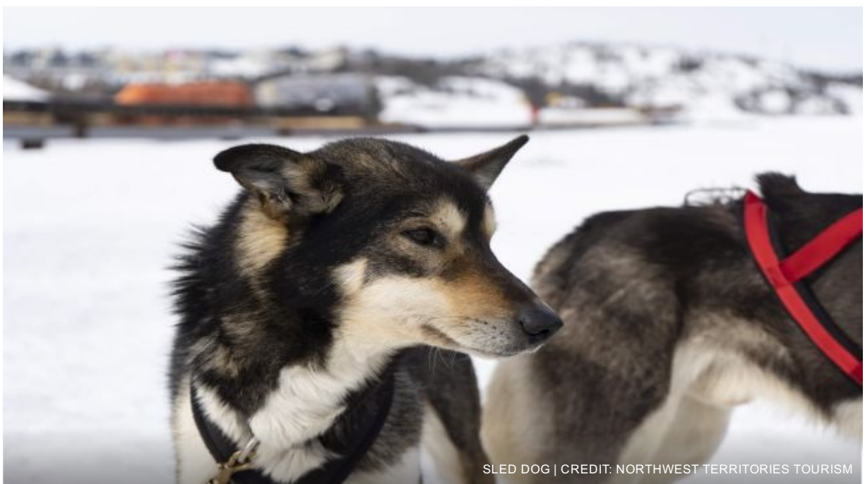
SLED DOG

Overnight in Yellowknife at The Explorer Hotel