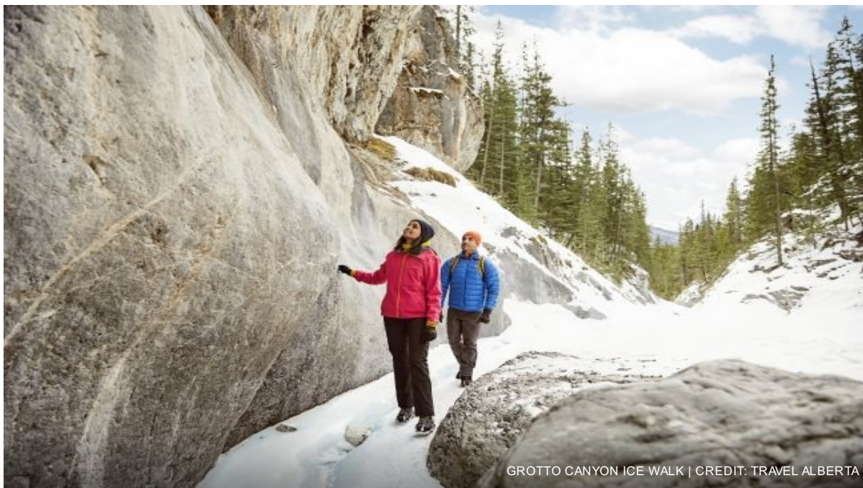
GROTTO CANYON ICE WALK

Overnight in Banff at Fairmont Banff Springs .