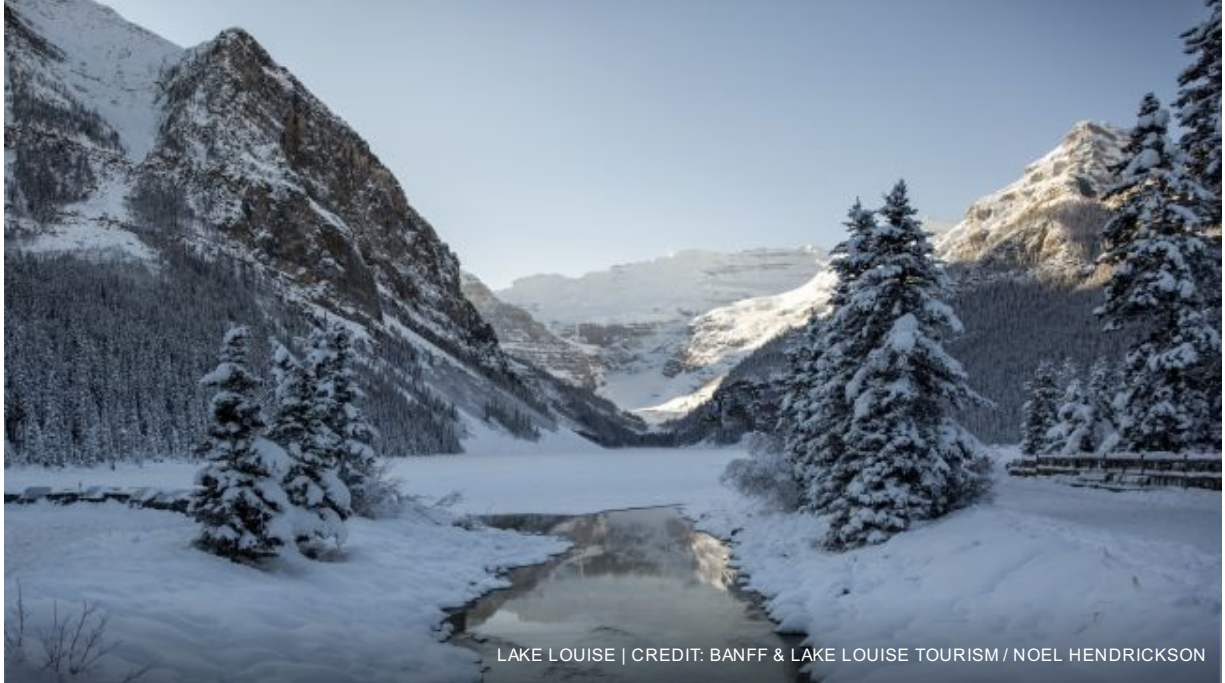
LAKE LOUISE

Overnight in Banff at Fairmont Banff Springs .