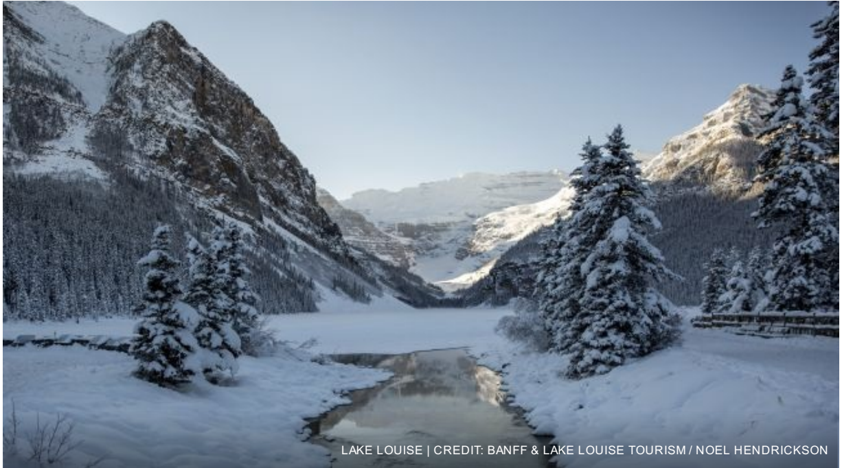
LAKE LOUISE

Overnight in Banff at Fairmont Banff Springs .