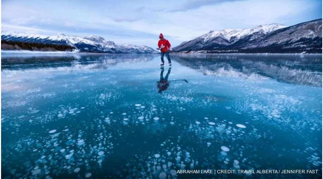
ABRAHAM LAKE