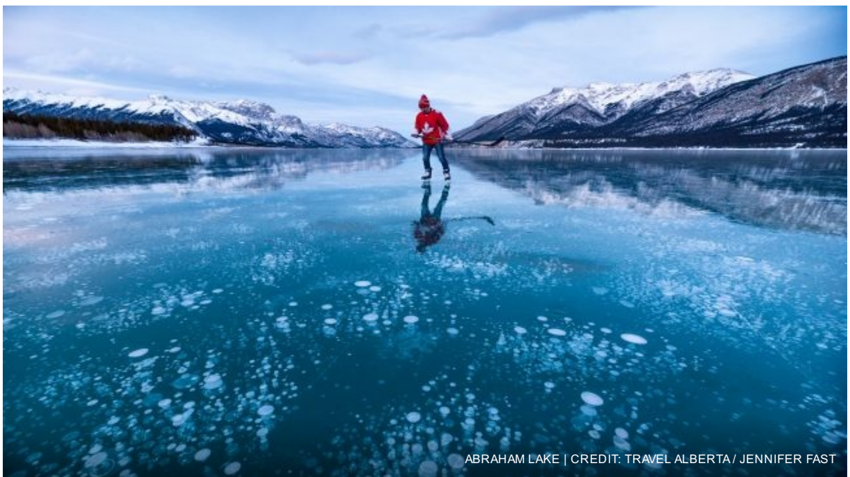
ABRAHAM LAKE