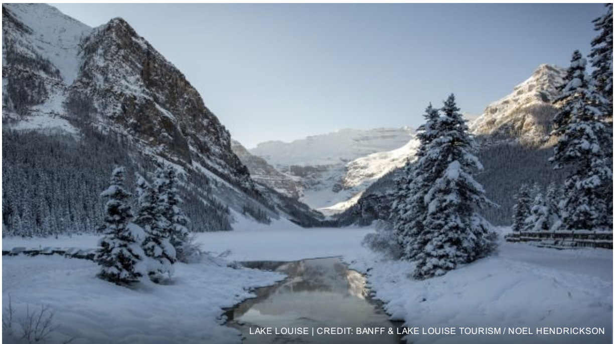
LAKE LOUISE